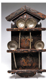
Polchrome Decorated Hanging Spoon Rack And Pewter Spoons

Rembrandt Van Rijn "The Descent From The Cross," 1633, Etching and Engraving on Wove Paper