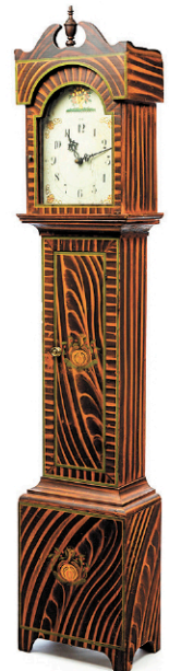
New England Paint-Decorated Pine Tall Case Clock