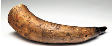
Philadelphia, Pennsylvania Carved Hunting Horn with Native American Motifs