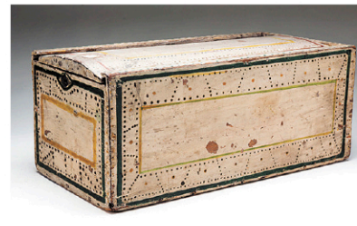
Wonderful American Folk Art Paint-Decorated Poplar Slide Lid Box