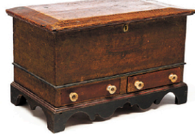
Grain-Painted Youth-Sized Blanket Chest Dated 1837