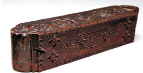
Chip-Carved Box, Dated 1839