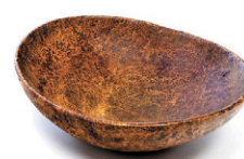
Native American Carved Burlwood Oval Bowl