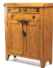
Grain-Painted Pine Jelly Cupboard