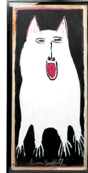
Large Jimmy Lee Sudduth House Paint and Mud on Plywood