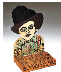
Howard Finster (Summerville, Georgia, 1916-2001) "Elvis at 3" Folk Art Sculpture, Dated 1991