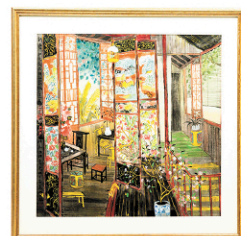
Fang Xiang Ink And Watercolor