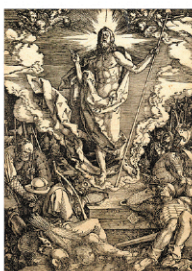
Albrecht Dürer "The Resurrection," 1510, Woodcut On Laid Paper