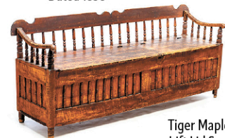
Tiger Maple Lift Lid Seat