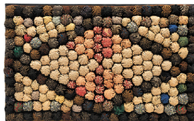
Folk Art Pom-Pom Rug