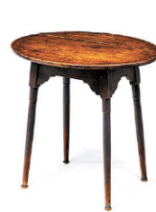
Queen Anne Blue-Grey Painted Pine Tavern Table