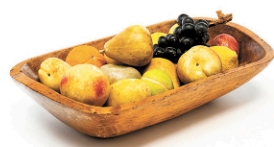
Carved Pine Trencher with Stone Fruit