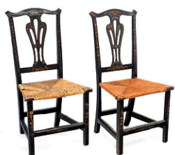
Pair Of New England Transitional Ebonized And Gilt-Decorated Side Chairs