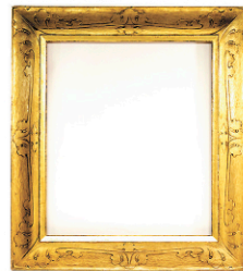
Large Labeled Newcomb-Macklin Arts and Crafts Giltwood Frame