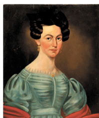
Folk Art Oil On Panel Portrait