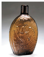
J. Sheppard And Co. (Zanesville, Ohio) Amber Glass Eagle Flask