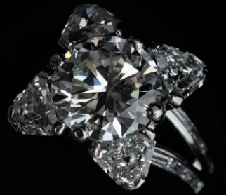
JACK WEIR & SONS