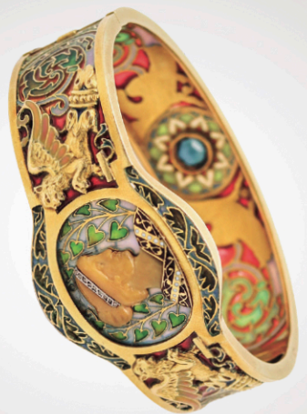
TREASURE FINE JEWELRY