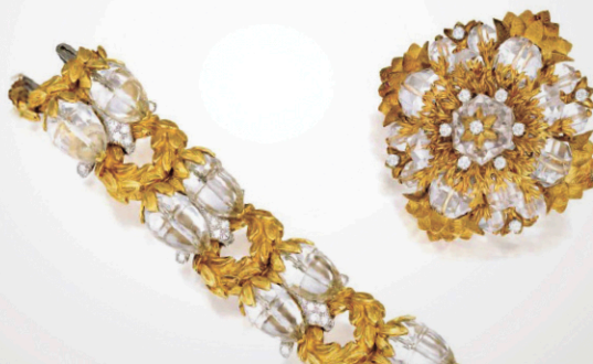
JERRY BLICKMAN INC.