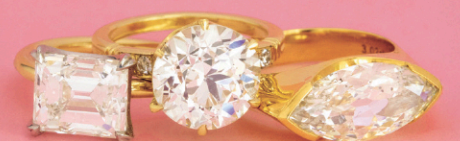
JEWELS BY GRACE