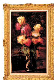
Jean Gabriel Domergue, Bouquet of Flowers Still Life, Signed Oil on Canvas Painting