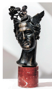
Winged Goddess of Victory Bronze Bust, Early 20th Century, Valsuani, Foundry Mark