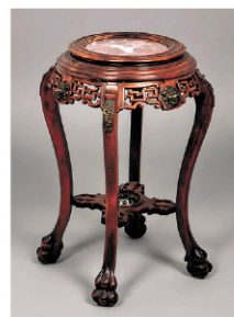
Gabriel Viardot Bronze mounted Orientalism Tall Pedestal Table c.1910