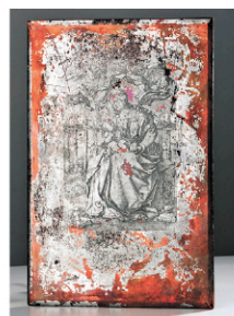
Edouard Baldus (French, 19th C.), Silvered Copper Etched Printer's Plate following Albrecht Dürer Subject