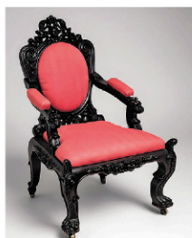
Armchair Anglo-Indian Carved Ebony Throne Armchair Mid 19th Century