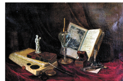
Trompe l'oeil, Oil Painting on Canvas, Still Life with Books, Mid 19th Century