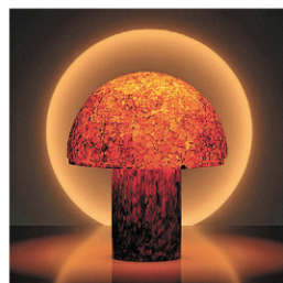
Peill & Putzler Labeled Important Mid-Century Art-Glass “Mushroom” Table Lamp, c. 1970s