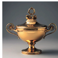
Gilt Silver Footed Bowl with Classical Motifs, 20th C., 291 grams