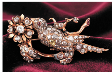
Impressive Diamond and Ruby Brooch, 19th Century