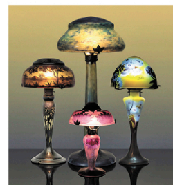
A Wonderful Collection of Art Nouveau Lamps Including Daum Nancy, Galle, Le Verre Français/Schneider