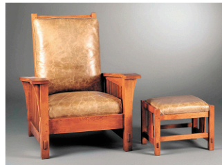
Stickley signed Adjustable Oak and Leather Reclining Armchair with Footstool, Mission Style, 20th Century