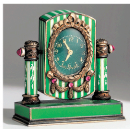
Tiffany & Co Gold Silver and Enamel Clock set with Jewels, Early 20th Century, Engraved Leather Case