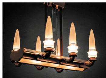
Exceptional French Art Deco Brass and Frosted Glass Chandelier, Circa 1930