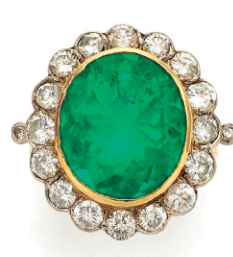
Two-Tone Gold, Emerald and Diamond Ring 14.50 cts