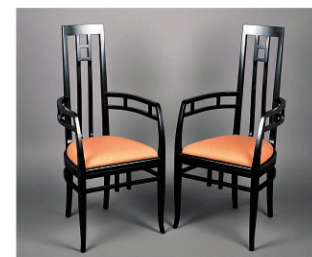
Giogetti Pair of Black Lacquered Armchairs, Italian Modernist with Vienna Secession Influence