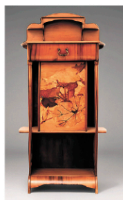
Louis Majorelle, Art Nouveau Carved Walnut Tall Cabinet with Inlaid Bird Panel, Nancy, Late 19th Century