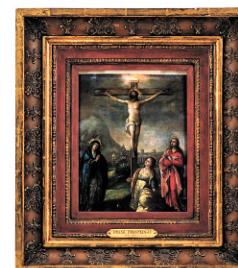
Frans Francken II “Golgotha”, Antique Oil painting on Hand Hammered Copper