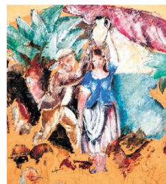
Charles Dufresne Signed Important Art Deco Oil Painting, Circa 1920s