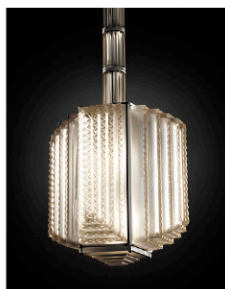
R. Lalique “Normandie” Frosted Glass Chandelier with Original Ceiling Cap and Pole Covers, Circa 1925

KINGSTON, N.Y. — Collective Hudson presents its Year End Holiday Prestige Sale , a curated celebration of French elegance and modern design just in time for gift-giving season. Anchored by an important Lalique collection —including Paris store fixtures, a “ Normandie ” frosted-glass chandelier with original ceiling cap and pole covers, and a bar counter/table with inset panels—the auction spans fine art, sculpture, art glass, period furniture, and exceptional jewelry & watches.