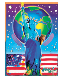
Signed Peter Max Double-Sided Painting and Drawing with Dedication