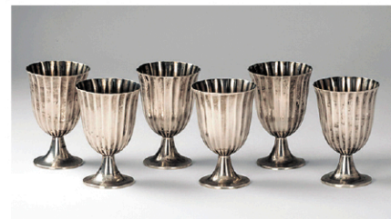
Tiffany & Co., Set of Six Sterling Silver Liqueur Cups Based on Josef Hoffmann Designs