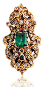
Antique Diamond and Emerald Ring in Ornate Openwork 14K Gold, Late 19th century