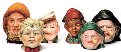
Lot of Six Antique Ceramic Tobacco Jars, Late 19th - Early 20th C.