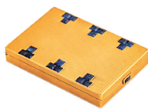
Charles Holl Art Deco Womens 18K Guilloché Gold Necessaire Beauty Set with Sapphires, Circa 1930s–1940s