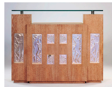
Lalique Store Bar Counter Lalique “Figurines et Raisins” Ceruse Oak inset Lalique Panels