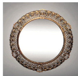
Anglo-Indian Pierced Brass Round Mirror, Early 20th Century