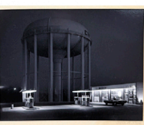
1048) George Tice Iconic Photograph Petit's Mobil Station