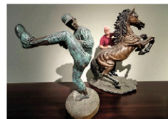
Full Bodied Bronzes Nolan Ryan and a Magnificent Rearing Horse