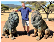
1005) Massive Bronze Palace Lions