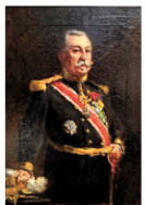
1015) 19th C Franz Joseph I Military Portrait Oil on Canvas