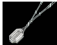
1055) Platinum 1.50 CTW Tiffany & Co. Voile Lavalier Necklace