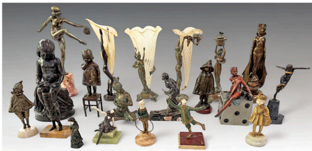
Great Selection of 19th & 20th C. Sculpture to include Chiparus, Laurel, Chalon, Kruff, and Tereszczuk