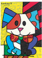
1009) Romero Britto Original Painting Puppy Love

Our November 16th Premier Estates Auction will feature Museum Quality Antiques, Fine Art, Sculpture and Jewelry from many Major Estate Collections Included will be Bronzes : A Regal Pair of Bronze Palace Lions; Bronze Dolphin Fountain; Life Size Nolan Ryan and Magnificent Rearing Horse; Versace Medusa Dinner Service; Stickley & Tiffany Lamps; Waterford Crystal; Sevres Vases; Estate Oriental Carpets, Arts, Crafts, Nouveau Furniture; Deco Bronzes & Lamps; Oriental Carpets to include 12.9' x 9.75' Persian Palace Carpet; Oriental Porcelains; 30 Guitars: Fender Stratocaster, Paul Reed, Badaax, Fender American Special Jazz Bass, Spector Sunburst, Rickenbacker Model 4003s, Lakland Skyline Series Bass; MCM : Benato Zevi For Felig Ellipse Rocker & Ottoman; Danish MCM Arne Vodder Sideboard with Hutch; Ekornes Loungers; SILVER : Many Boxed Sterling Dinner Silver Dinner Services, Gorham Chantilly; Coin Collections; JEWELRY : Chanel J12 Chromatic Wristwatch; Omega Seamaster; Estate Jewelry that Must Be Sold! $27,000.00 Diamond Drop Necklace; Platinum 3ctw Diamond Ring; Watch this list grow with many surprises as it will keep growing right up to Auction time. Prepare to be amazed!