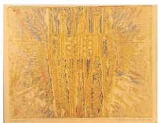
1445) Krishna Reddy Artist Proof MCM Etching