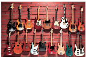
Electric Guitars from the Band Siren including Ernie Ball Music Man, Fender, and more!