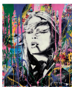
1274) Mr. Brainwash Mixed Media