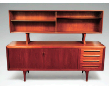
1235) Danish MCM Arne Vodder Sideboard with Hutch