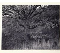
1049) George Tice Oak Tree Photograph