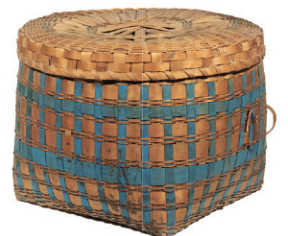
7108 Covered Maine Native American Splint Basket, ca. 1900