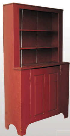
7020 19th c. Maine Open Top Pine Pewter Cupboard

20+ RUGS | 20+ NATIVE ITEMS | 50+ LOTS OF REDWARE & STONEWARE | 50+ BASKETS | 30+ DECOYS | 10+ FOLK ART PAINTINGS