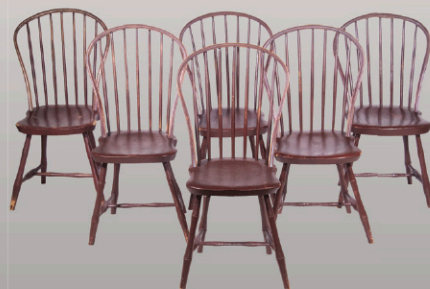
7035 (6) Bow-Back Windsor Chairs