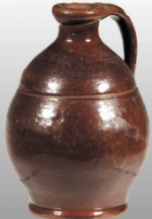
7039 MAINE REDWARE