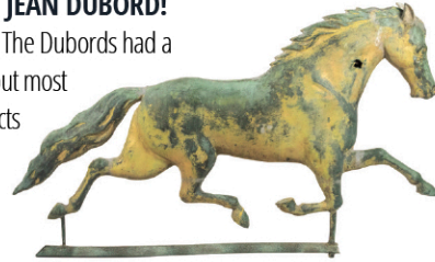
7010 Ethan Allen Gilt Weathervane