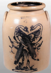
7011 J & E NORTON