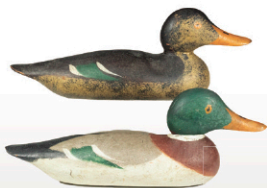
7292 Mason Factory Painted Mallard Decoys