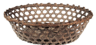
7152 Shaker Cheese Basket