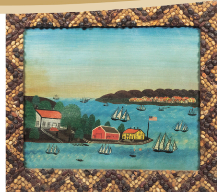
7016 American Folk Painting w/ Decorative Bean Frame