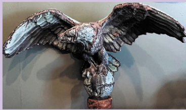
19th-c. pilot house copper eagle, 32" span.