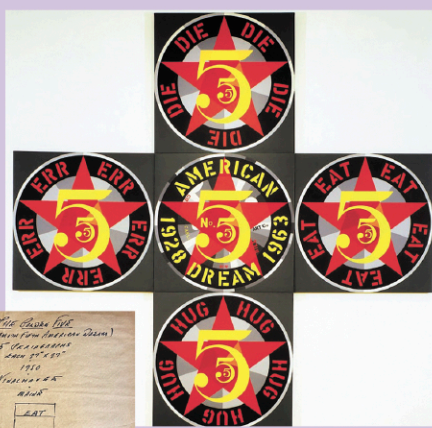
Robert Indiana, 1928-2018. The Demuth American Dream #5 (The Golden Five) , signed artist proof #10 of 18. Detailed images available.