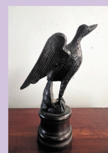
Schimmel-style carved walnut eagle.