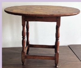
18th-c. country Queen Anne button-foot tavern table.