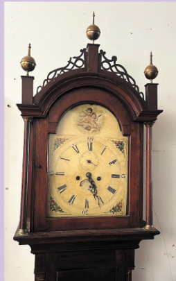
American tall clock with inlay, unsigned.