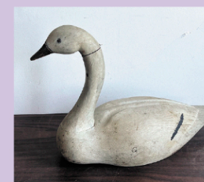
Wonderful white swan decoy, 20".