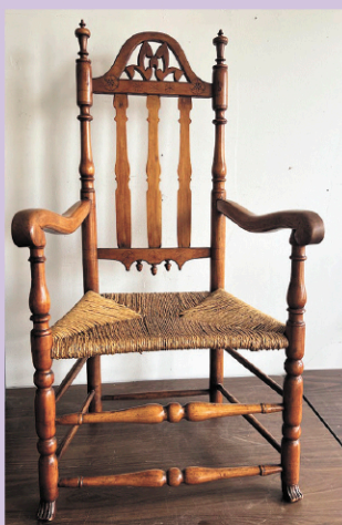
Rare bannister-back armchair with carved pinwheels and paw feet.