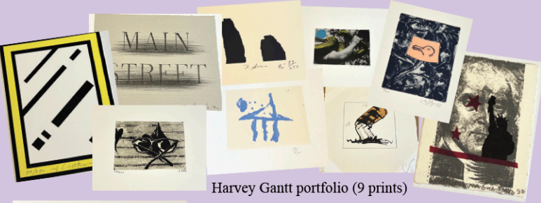
Harvey Gantt portfolio (9 prints)