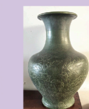
Important art pottery vase, 21" tall.