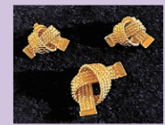
14k Tiffany suite, 7.5 dwt.