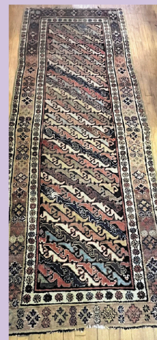
Early Persian runner, 3'4" x 8'7".

TERMS: 17.5% Buyer's Premium with 2.5% discount for check or cash. • Checks accepted with proper I.D. or preapproval • MC/Visa/American Express Maine sales tax of 5.5% applies • Dealers must supply tax I.D. certificate • Auctioneer reserves the right to hold certain items until checks clear • All listings are subject to error