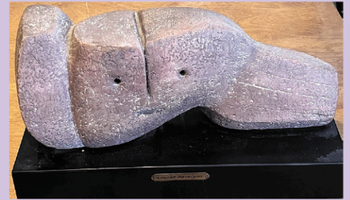
Tattistone sculpture by Louise Nevelson, 1899-1988, 14".