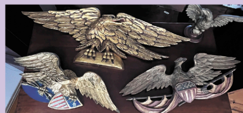
Selection of carved eagles.