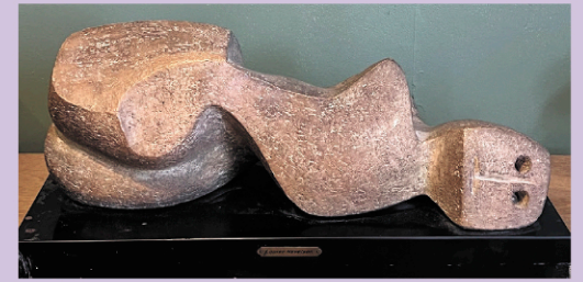
Tattistone sculpture by Louise Nevelson, 1899-1988, 22".