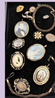
Important collection of antique mourning jewelry, (4) trays, over 120 pieces.