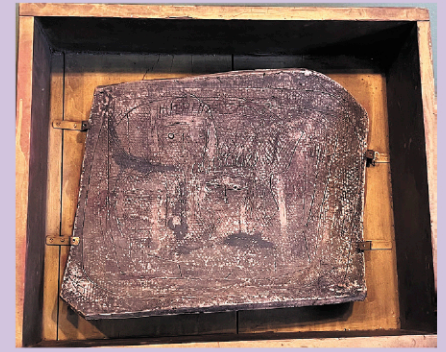
Tattistone shadowbox plaque by Louise Nevelson, 1899-1988, 14" x 17".

We gladly accept absentee and live phone bidding. Please call with any questions.