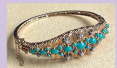
Fine 14k bracelet.