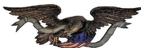
203: 6' Cast Iron Eagle