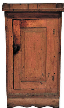
247: Raised Panel one Door Cupboard in salmon