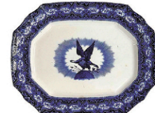
210: C. 1840 American Eagle Platter