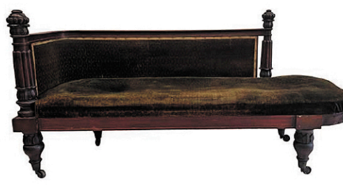
186: Late Federal Recliner