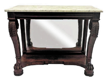
127: Marble Top Pier Table, Boston