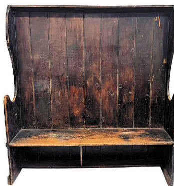
232: 18thC. Settle Bench