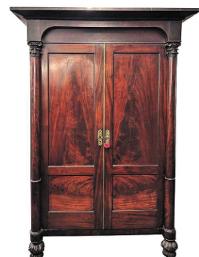
114: Meeks, C. 1825 NY Mahogany Armoire