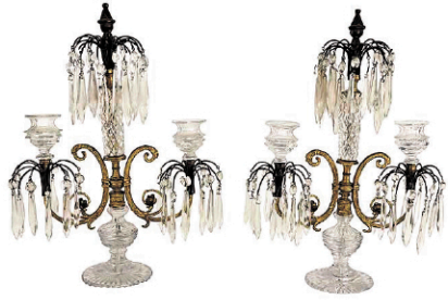
101: Pair of Regency Double Branch Girandoles

Preview: Mon. 9/8 – Sat. 9/13, 10am - 4pm • Sun. 8am until sale or by appointment