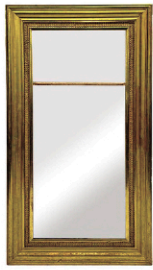
154: Two Panel Giltwood Pier Mirror, Albany NY