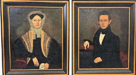
57: Pr of Portraits Attrib. to Erastus Salisbury Fields