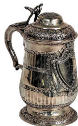
43: 18thC. Irish Sterling Silver Tankard