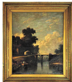
80: O/C signed E. C. Coates