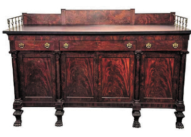
177: Duncan Phyfe Sideboard