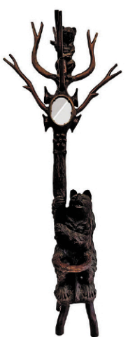
349: Black Forest Bear Hall Rack