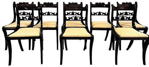
103: Set of 8 Federal Chairs, Attrib. to Duncan Phyfe