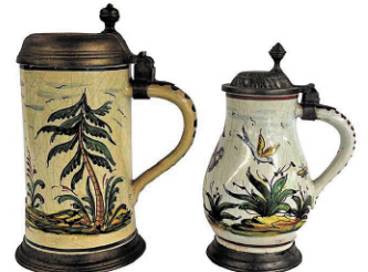
215: 2 Early Faience Pewter Bound Steins