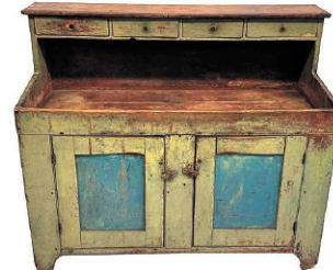
240: Dry Sink in green / blue paint