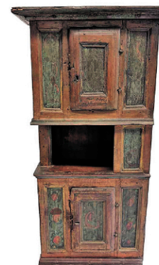
218: Pilgrim Period Cupboard