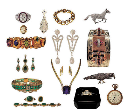
Over 50 lots of Estate Jewelry