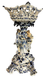
87: Meissen Centerpiece