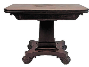
123: C. 1815 Isaac Vose, Boston Card Table