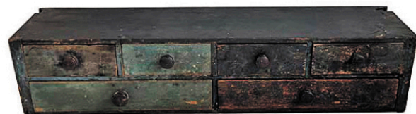
238: Apothecary in Blue