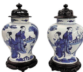
70: Pr of Blue & White antique Chinese Ginger Jars