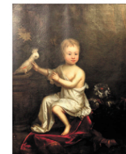
Follower Of Willem Wissing (Dutch, 17th Century) Elizabeth Brownlow, Later Countess Of Exeter, As A Child, 18th Century

SLOANS & KENYON Auctioneers and Appraisers