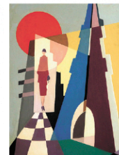
French School (Late 20th Century) Parisian Woman And Eiffel Tower