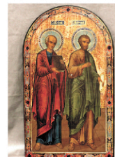
Russian Icon Of Saints Apostles Peter And Paul