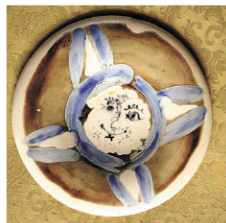
Pablo Picasso Limited Edition Ceramic Plate (Spanish, 1881-1973) "Visage No. 72"