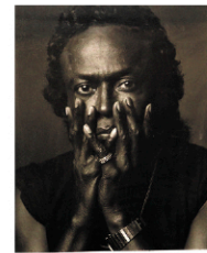
Annie Leibovitz (American, Born 1949) Portrait Of Miles Davis, Circa 1989, Photograph. Unsigned. Developed And Processed From An Original

Absentee, Telephone and Internet Bids Accepted