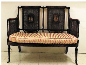
Neoclassical Settee With Paint Decoration And Caning