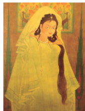
Abdur Rahman Chughtai (Pakistani, 1894 - 1975) Untitled (Beauty In A White Dress) Circa 1969