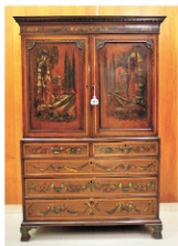
George III Paint-Decorated Linen Press, Circa 1790