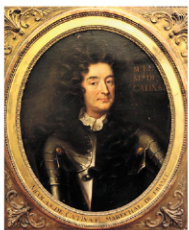
French School (18th Century) Nicolas Catinat De La Fauconnerie (1637- 1712), Commander And Marshal Of France Under The Reign Of Louis XIV