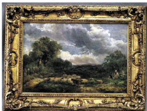
Theodore Rousseau (French, 1812-1867) The Young Shepherd