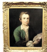
Follower Of John Opie (British, 1761-1807) Portrait Of Young Man Consulting A Diagram