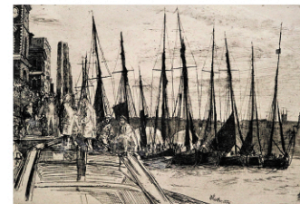
James Abbott McNeill Whistler (American, 1834 - 1903) Billingsgate, Circa 1859