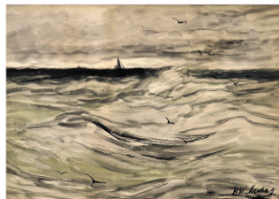
Hendrik Willem Mesdag (Dutch, 1831-1915) Hooze Zee