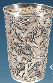
14 pcs. Chinese Export Silver