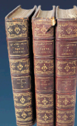
Quadrupeds of North America