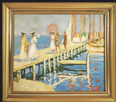
Jane Peterson School