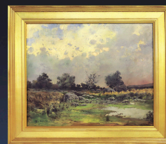
Willard Leroy Metcalf