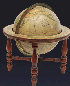
1 of 2 Joslin Globes