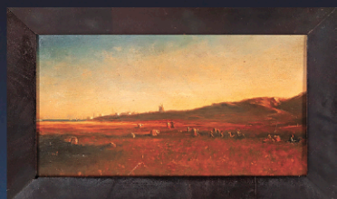
After Eastman Johnson