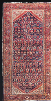
19 Oriental Rugs