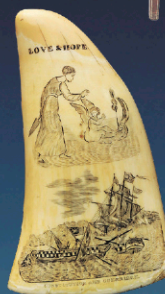
19th c. Scrimshaw