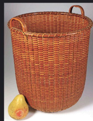
21 Nantucket Baskets