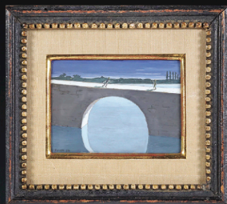
Fulco Di Verdura