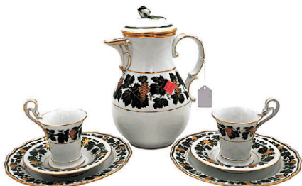
Meissen Set of 31