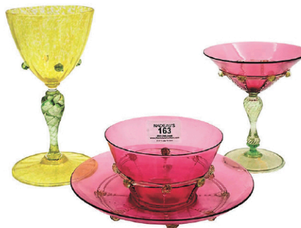
Venetian, Set of 32