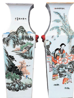
Chinese, Height 22"