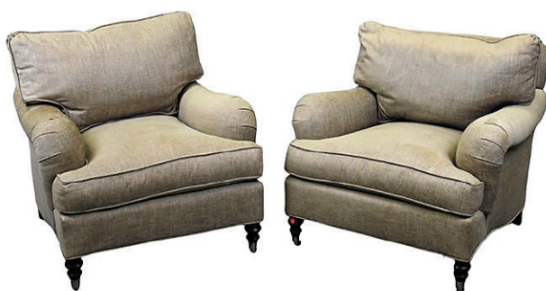
George Smith Custom Chairs