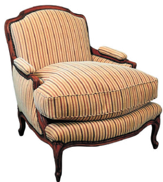
De Angelis Custom Armchair

July 19, 2025 at 10am | Previews: Thurs. July 17, 2-6:30pm • Fri. July 18 12-5pm • Sat. July 19, 9-10am