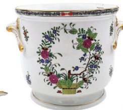
Herend, Height 8.5"