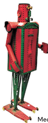
Mecano Walking Robot