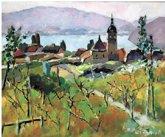
Alfred Chagniot Oil on Canvas 20"x 24"