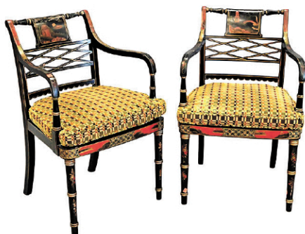
Regency Chinoiserie Decorated