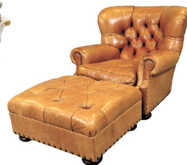
Ralph Lauren, 1 of 2