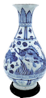
Chinese, 1 of 50+ Lots