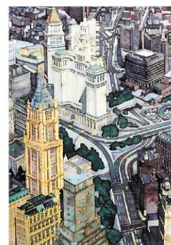
George Harkins NYC Watercolor 40"x 28"