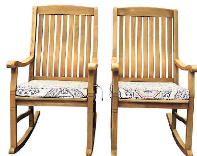
Outdoor Teak, 1 of 3 Lots