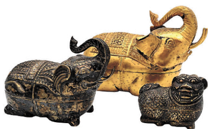
Silver, 1 of 40+ Lots