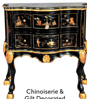
Chinoiserie & Gilt Decorated Width 38"