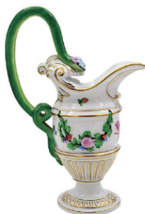
Herend, 1 of 7 Lots