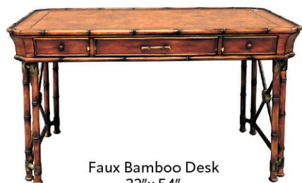
Faux Bamboo Desk 32"x 54"