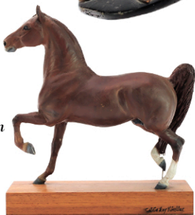
Part of a good selection of horse carvings by Calvin Kinstler