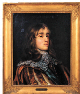
Anton van Dyck, French School, 20th Century Oil on Canvas Painting