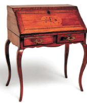
French 18th C. Inlaid Drop-Front Desk with Cabriole Legs