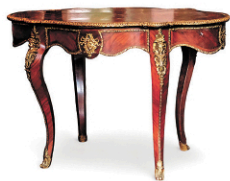
Napoleon III Kingwood Center Table with Ormolu Masks & Putti