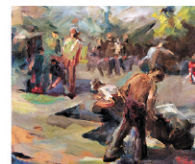
Isaac Israëls, "Workers at Work" Signed Oil on Cardboard Painting