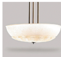
Murano Venetian Art Glass Mid Century Ceiling Fixture