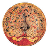
19th Century Majolica Tin-Glazed Enamelled Ceramic Dish with Peacock Relief