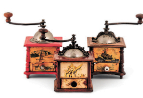
Collection of Coffee Grinders, Circa 1900's