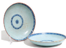
Chinese Export Porcelain Plates for Dutch East India Company, 18th Century