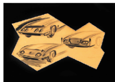
Raymond Loewy Signed Charcoal Drawing Car Concept Study, Studebaker Avanti