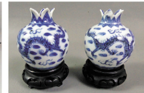
Early Chinese vases