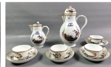
Meissen Marcolini tea set