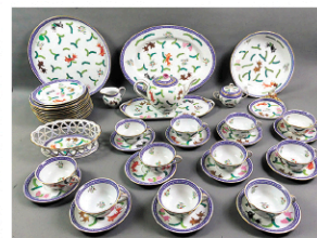
Herend Poisson dinner set