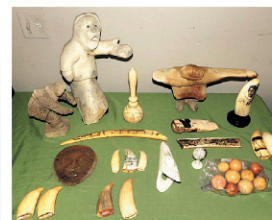
Inuit & whale items