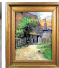
Theodore Robinson painting