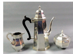
Robinson sterling tea set