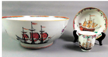
Qing Period china