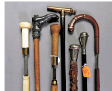
Over 100 fine canes