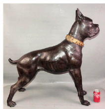
3 ft. bronze dog