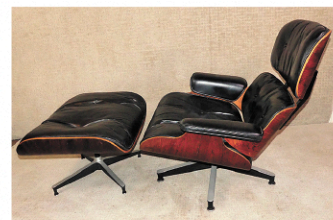
Eames Miller chair