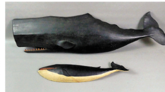
2 Clark Voorhees whales