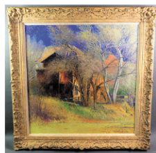
Curt Walters painting