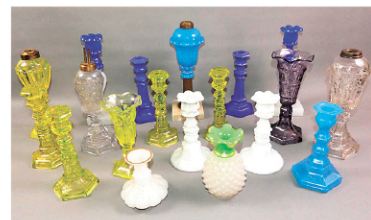
Collection Sandwich Glass