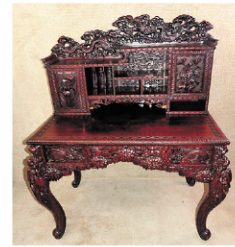
Fine Chinese furniture