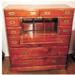
19th C. campaign chest

PREVIEW: Peruse in-person: July 17, 18 & 19 (Thurs/Fri/Sat.) from 10-4pm & 9-11am on Sunday.