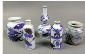
Mini Chinese vases