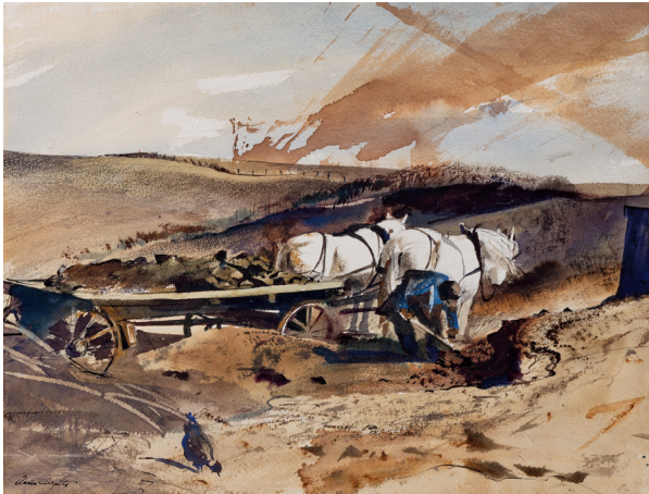
Andrew Wyeth (1917-2009) Adam and His Wagon