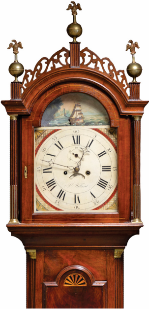
Over 70 clocks including Willard Tall Case and Fine & Rare Walter H. Durfee Banjo