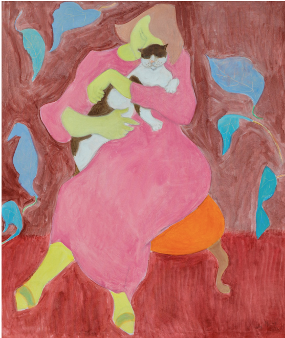
Sally Michael Avery (1902-2003) Cat Lady , 50 x 42 in.

September 25th, 2025 Fine Art & Antiques