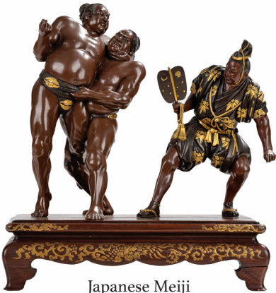
Japanese Meiji Sumo Wrestlers