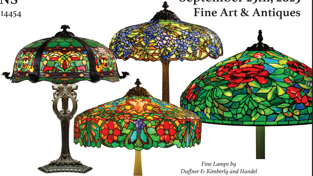
Fine Lamps by Duffner & Kimberly and Handel