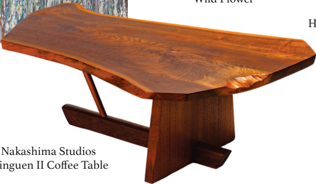
Nakashima Studios Minguen II Coffee Table