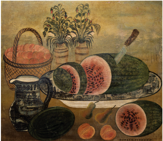
American Folk Art Primitive