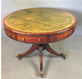
Regency Mahogany Leather Top Drum Table