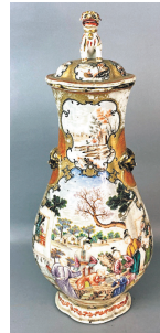
18th C. Chinese Export Lidded Vase