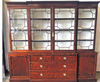
19th C. English Mahogany Breakfront Bookcase