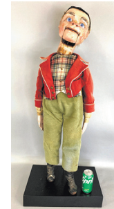
Vintage Ventriloquist Dummy