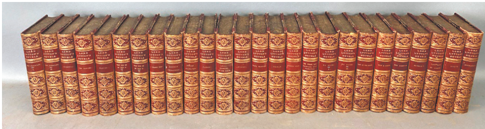
Leather Bound 26 Volumes "Lord Lytton's Novels"