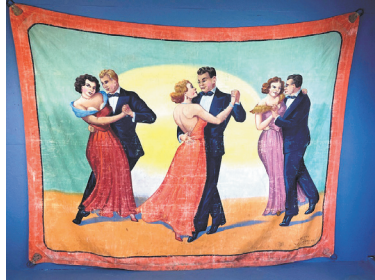
Circus Poster on Canvas