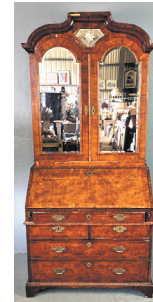
Georgian Walnut Double Dome Bureau Bookcase