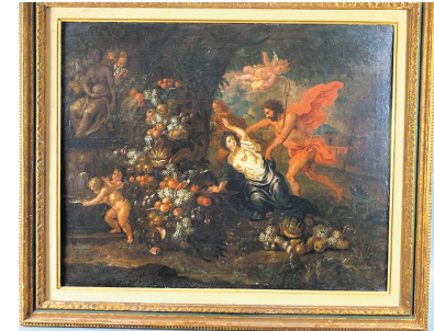
18th C. Italian Old Master