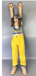
Cruikshank Folk Art Hanging Boy Figure