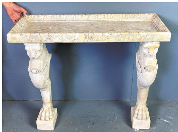
Carved Marble Console w/ Griffins