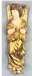
19th C. Giltwood & Polychrome Angel