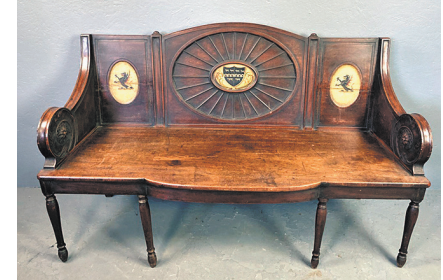
19th C. English Mahogany Hall Bench