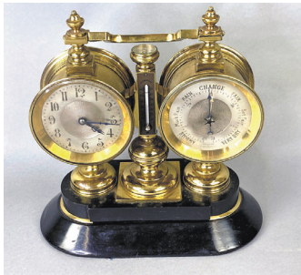
19th C. Brass Clock Barometer, Thermometer, and Compass