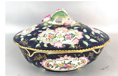
18th C. Large Worcester Soup Tureen