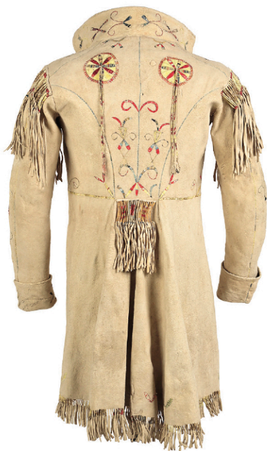
QUILLED PLAINS CREE MENS COAT