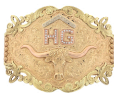
CUSTOM AMHAD KAHN GOLD AND DIAMOND LONGHORN BELT BUCKLE