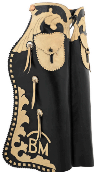
HAMLEY & CO. SHOW CHAPS