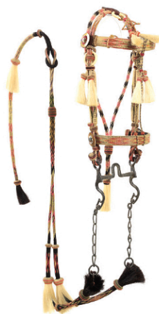
DEER LODGE PRISON HORSEHAIR BRIDLE

SANTA FE COMMUNITY CONVENTION CENTER 201 W MARCY ST, SANTA FE, NM 87501 WWW.OLDWESTEVENTS.COM