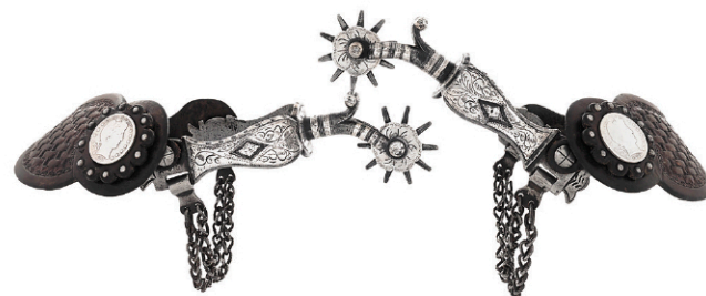
AUGUST BUERMANN DOUBLE MOUNTED #1471 "DANDY" SPURS