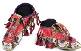
BEADED AND QUILLED SIOUX MOCCASINS