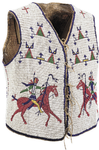
NORTHERN PLAINS SIOUX PICTORIAL BEADED VEST