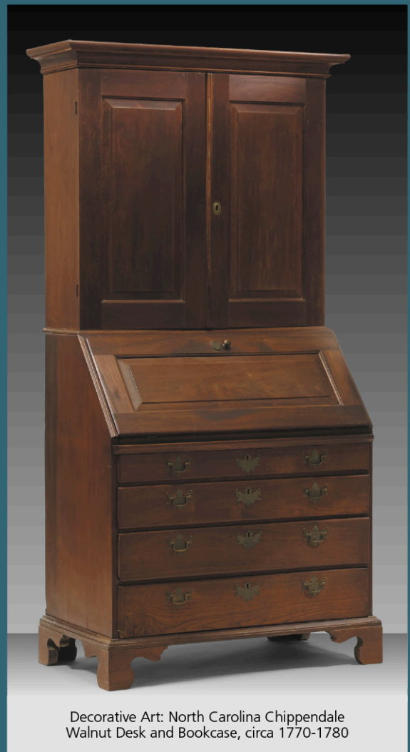
Decorative Art: North Carolina Chippendale Walnut Desk and Bookcase, circa 1770-1780