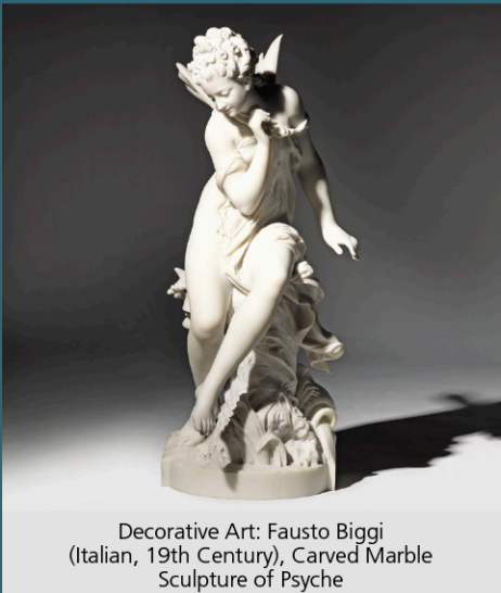
Decorative Art: Fausto Biggi (Italian, 19th Century), Carved Marble Sculpture of Psyche