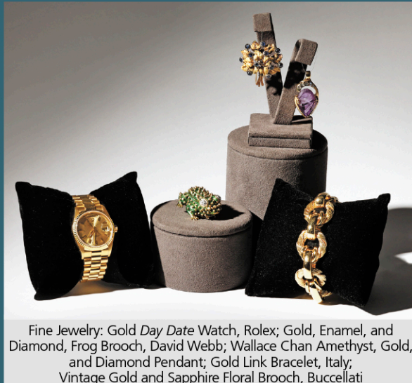
Fine Jewelry: Gold Day Date Watch, Rolex; Gold, Enamel, and Diamond, Frog Brooch, David Webb; Wallace Chan Amethyst, Gold, and Diamond Pendant; Gold Link Bracelet, Italy; Vintage Gold and Sapphire Floral Brooch, Buccellati