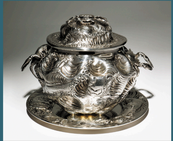
Fine Silver: Gorham Sterling Silver Oyster Tureen with Cover and Underplate, 1885. Exhibited: Gorham: Masterpieces in Metal , RISD, Oct. 14, 1983-Feb. 12, 1984