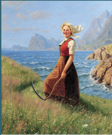
Fine Art: Hans Dahl (Norwegian, 1849-1937), Young Woman with Scythe