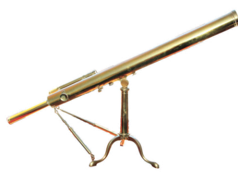
lot 543 Circa 1790 Dolland, London telescope with original mahogany box