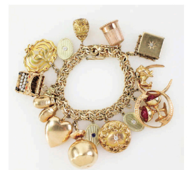
lot 533 Gold Charm Bracelet 14k and 18k Charms

Consignments now invited, contact consignments@kaminskiauctions.com