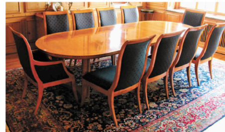
lot 534 Biedermeier-style dining room table with (8) chairs, (2) armchairs, upholstered