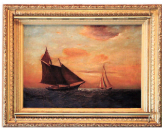
lot 575 Simpson, "Sailboats at Dusk", oil on canvas, 26" x 36"