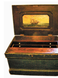
lot 761 Antique sailor's trunk, circa 1869