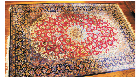
lot 716A Isfahan rug, 5' x 7'8"