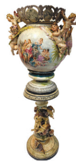
lot 631 19th century French painted urn on pedestal, 69" x 30"