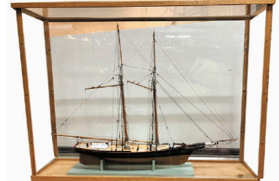
lot 700 Cased Model of Gaff-Rigged Schooner