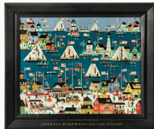
lot 710 Rosebee, Lobster Boats Racing the Storm