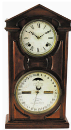
lot 699 Ithaca Calendar Clock Co. Calendar Clock