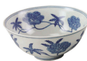
lot 970 Two Chinese Blue and White Ming-style Bowls