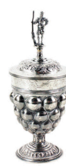
lot 504 Sterling Silver Chalice with Finial of Soldier