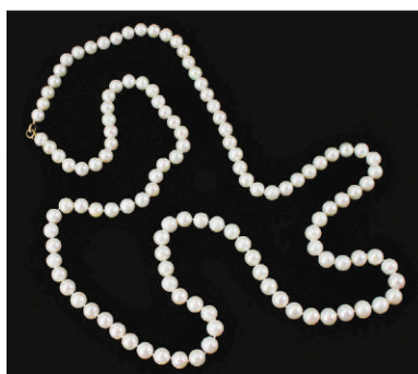
lot 532 South Sea pearl long strand necklace having an 18k gold clasp, pearls 11-12mm, 56" L