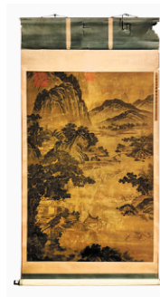
lot 905 18th/19thC Chinese Scroll of Mountains, Figures, and Boats