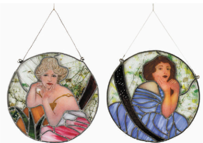
lot 512 Paul Prue Stained Glass Roundels of Women