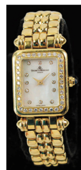
lot 501 Baume and Mercier 18k Gold and Diamond Watch