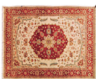
lot 716 Fine Serapi rug, 12'1" x 8'9"