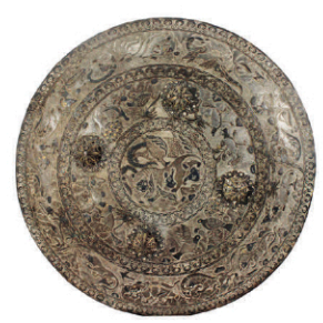
lot 578 18th/19thC Persian Ornate Warrior Shield