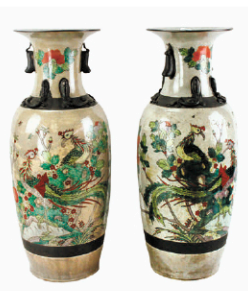
lot 852 Pair of Chinese urns, 23" x 19"