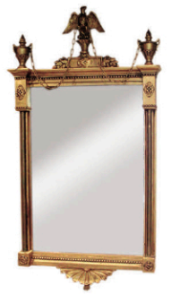
lot 733 Large Federal-style mirror