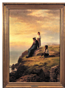
Edward Moran (American, 1829 - 1901) "Waiting for the Skipper" Oil painting. Sight size: 36 x 25 inches.