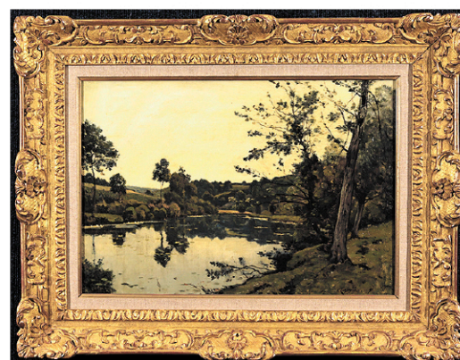
Henri Joseph Harpignies (French, 1819 - 1916) Barbizon landscape painting. Sight size: 15 x 21.5 inches.