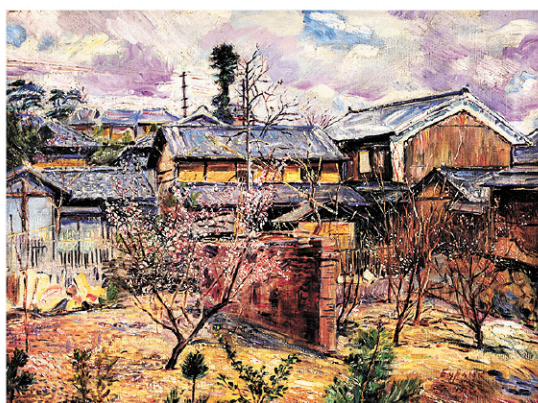
David Davidovich Burliuk (1882 - 1967) "Suma Japan" Oil painting. Sight size: 18 x 24 inches.