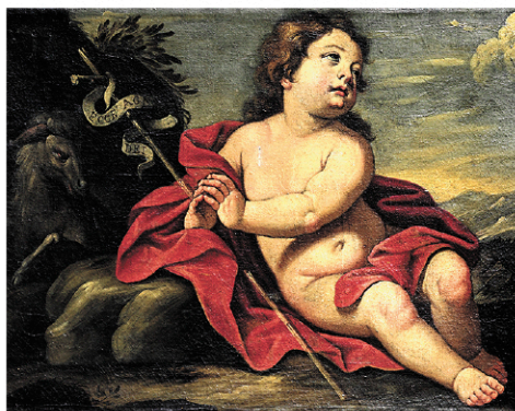
17th C. Old Master School, Infant St. John. Oil/Canvas. Sight size: 25.5 x 34.5 inches.