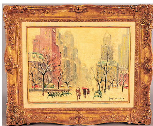
Guy Carleton Wiggins (NY, 1883-1862) "Central Park" Oil Board painting. Titled verso. Sight size: 12 x 16 inches.