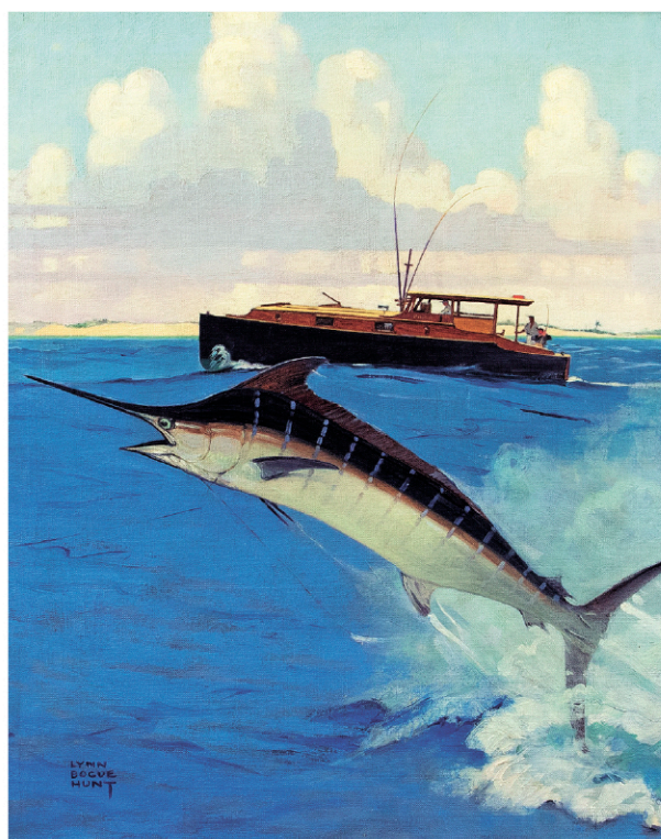
Lynn Bogue Hunt (1878-1960), The "Pilar" Fights a Blue Marlin Off Cuba , Ernest Hemingway, 1940, oil on canvas, 22 by 18 in.