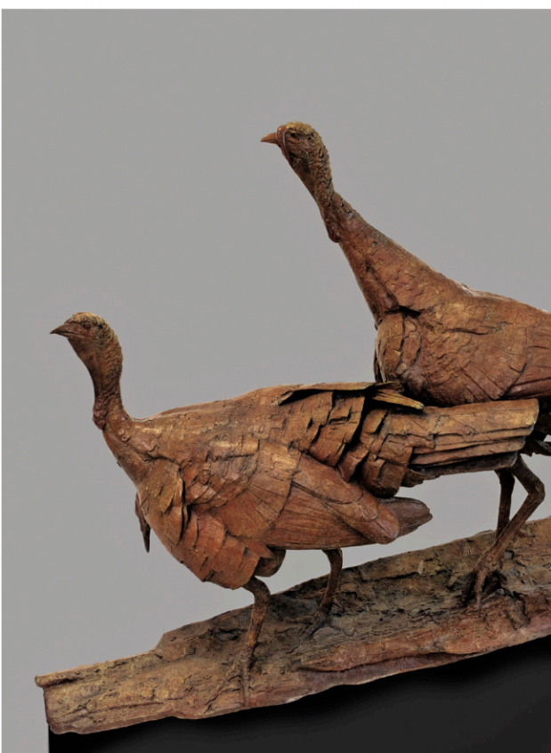
Walter Matia (b. 1953), Deuces Are Wild , 2002, bronze, 38 by 53 by 25 in.