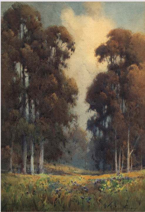
12. Maynard Dixon, Arizona Landscape , 1944, oil on board, 10.5" x 13". 13. Thomas Hill, Hetch Hetchy (California) , oil on board, 15.5" x 12.5". 14. Percy Gray, Eucalyptus Trees with Field of Irises , watercolor, 18" x 13" (1 of 2 to be offered).