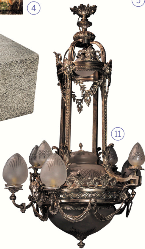
1. Emmi Whitehorse, Kin Nah Zin II #226, mixed media on paper, 27.5" x 39". 2. A Cartier France ruby, diamond, frosted rock crystal and 18k gold brooch. 3. An 18k gold strap bracelet. 4. Senaka Senanayake, Boats in the Harbor (Seascape) , 1964, oil on canvas, 23" x 34.25". 5. A Tibetan thangka depicting Vajrabhairava, 18th century. 6. A Chinese huanghuali seal chest, Qing dynasty. 7. A diamond and 18k white gold ring. 8. Duane Flatmo, Galloping Horse , mixed metal sculpture, 38.5" x 29" x 10". 9. A Woods & Chatelier sterling silver jewelry box. 10. A Chinese carved cinnabar lacquer circular box and cover, Qianlong period. 11. A fine and imposing Belle Époque silvered bronze nine-light chandelier.