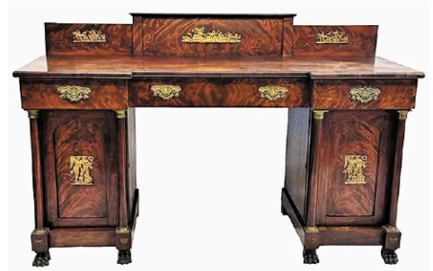
Lot 32: Late Federal Period Mahogany Double Pedestal Sideboard