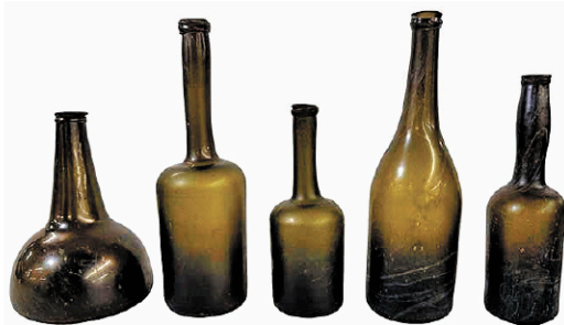
Lot 289: Early Blown Bottles