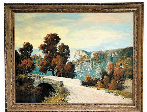
Lot 1: A. D. Greer Texas Landscape