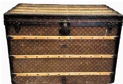
Lot 324: Vintage Louis Vuitton Steamer Trunk