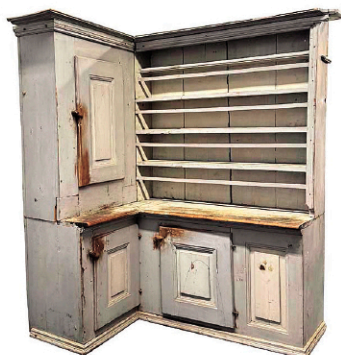
Lot 260: Grey "L" Shaped Wall Cabinet