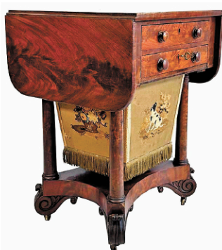
Lot 122: Isaac Vose Work Table with original bag