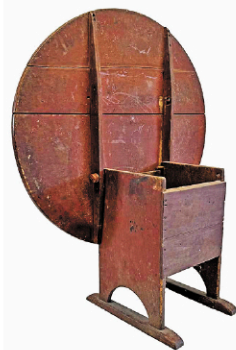
Lot 245: Shoe Foot Hutch Table in red