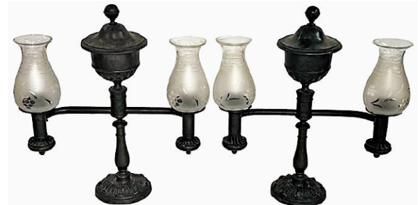
Lot 82: Pr of Double Arm Bronze Argand Lamps