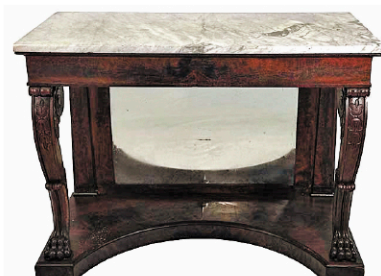
Lot 118: Philadelphia Marble Top Pier Table