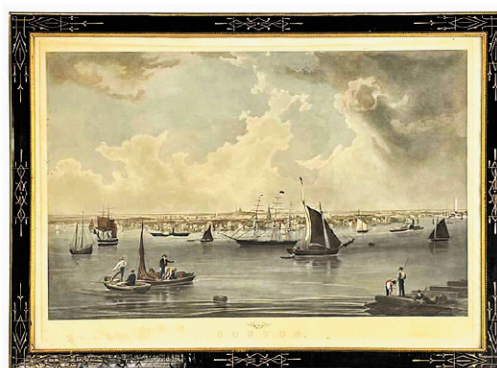
Lot 120: Lg Folio "Boston Harbor" after JW Hill