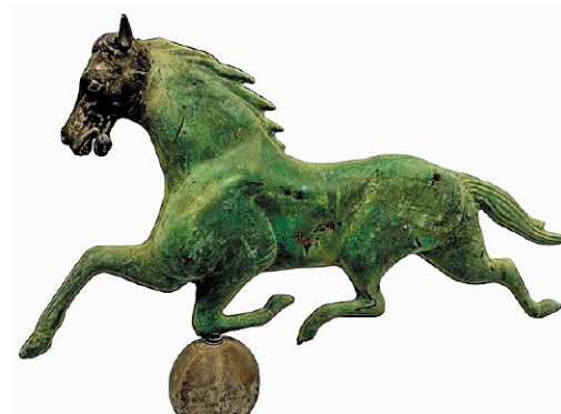
Lot 239: Full Bodied Running Horse Weathervane