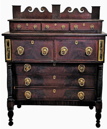
Lot 158: Labeled Levi N. Leland, 1828, MA Chest with Eglomise Panels in orig. surface