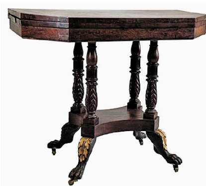
Lot 97: NY Classical Card Table Attrib. to Duncan Phyfe