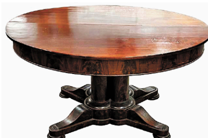
Lot 48: Briggs Patent Accordion Action Dining Table