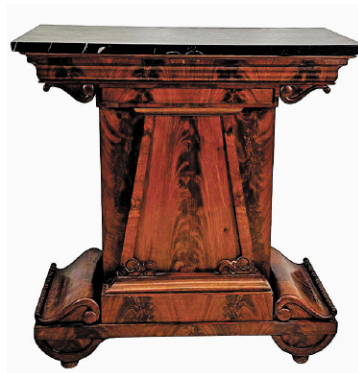
Lot 53: Rare Baltimore Mixing or Pillar Cabinet, Egyptian Marble