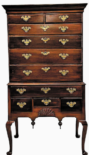
Lot 20: 18thC. Newport RI Highboy