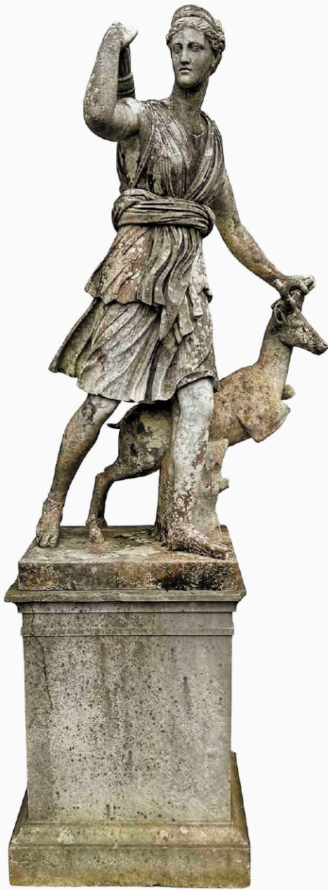
Lot 150: Important Early 19thc. Marble Statue of Diana of Versailles also known as Artemis, Goddess of the Hunt. Statue & pedestal 93" tall

Previews: Monday, June 16 – Saturday, June 21, Noon–5pm; Sunday, June 22, 8am until sale or by appointment