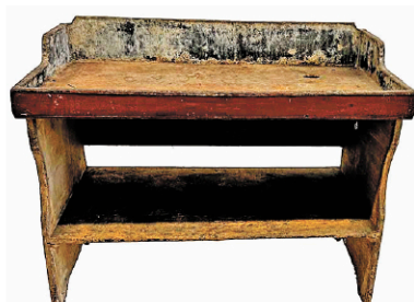
Lot 251: Dry Sink in Yellow & Red Paint