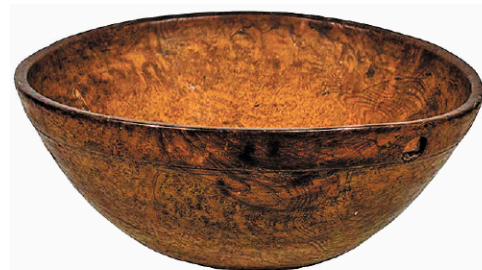
Lot 227: 13" American 18thC. Burl Bowl