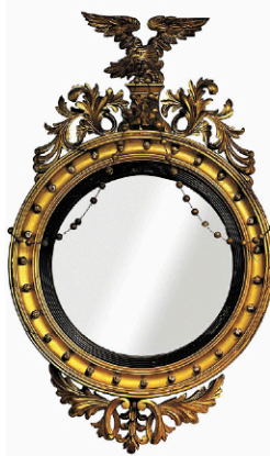
Lot 129: Eagle Crested C.1810 Convex Mirror, orig gilding