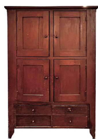
Lot 229: 19thc. 4 Door 4 Drawer Wall Cabinet in Red Paint