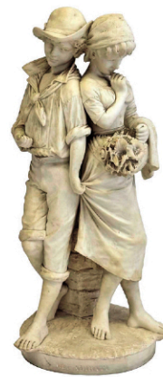
Lot 41: Marble Statue "Gli Adirati" sgnd C. Lapini