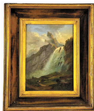
Lot 147: American School "Pissevache Falls" Switzerland, School of Bierstadt