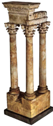
Lot 37: Grand Tour Marble Model "Temple of Vespasian"