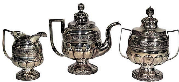
Lot 151: C.1805 Coin Silver Tea Set