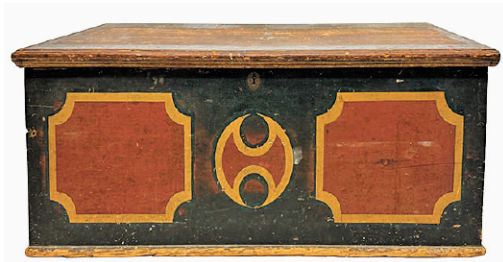
Lot 238: Mohawk Valley Paint Decorated Blanket Chest