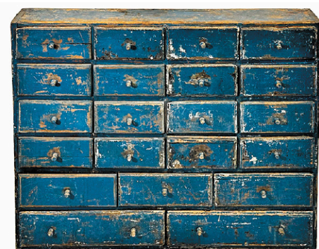
Lot 215: 21 Drawer Apothecary in Blue Grey