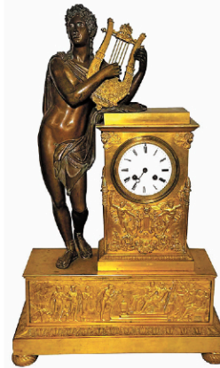
Lot 83: Dore Bronze Figural Mantle Clock