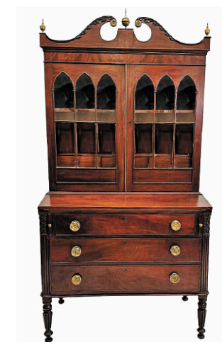
Lot 72: Salem, MA Secretary Attrib. to Workshop of Samuel McIntire