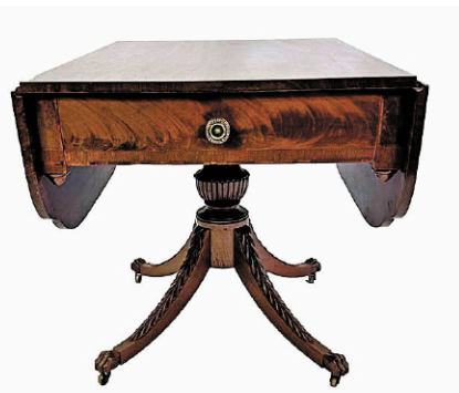
Lot 4: Phyfe Pembroke