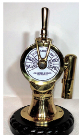
Lot 2a Ships Engine Order Telegraph by Joseph Harper and Sons