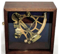
Lot 137 Ships Sextant in a custom Mahogany Wall Box