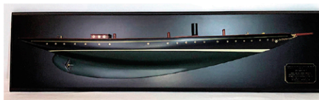
Lot 20 Half Model of the Schooner Atlantic