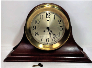
Lot 11 Chelsea Ship's Clock with Large Ten-Inch Bezel