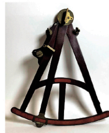
Lot 188 Eighteenth Century Navi- gators Quadrant