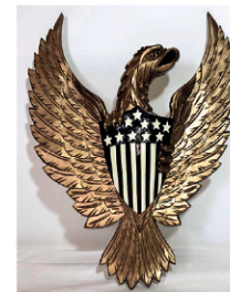
Lot 434 Carved Wood Federal Eagle