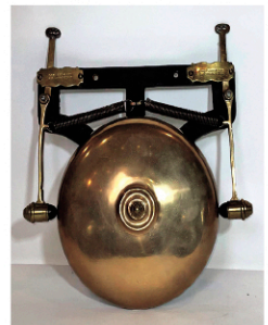
Lot 269 Ship's Engine Room Gong for Use with Engine Order Telegraph