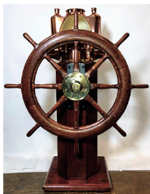
Lot 8 Ship's Wheel with Binnacle Unit