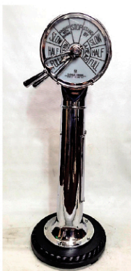
Lot 068 Ship's Telegraph with Chrome Plated Finish by Durkee