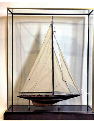
Lot 357 J Class Yacht Endeavour in Case