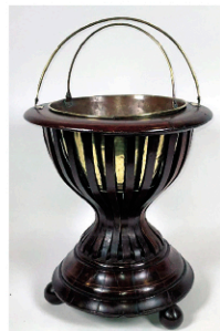
Lot 126 Rosewood and Brass Library Planter