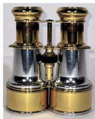
Lot 19 Binoculars Engraved U.S. Field, Marine, Army, Navy