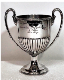
Lot 23 New York Thirties NYCC Trophy