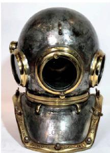
Lot 60 Deep Sea Diving Helmet Replica of a CE Heinke