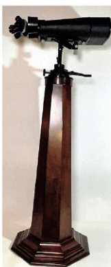
Lot 109 British Royal Naval Admirals Spyglass