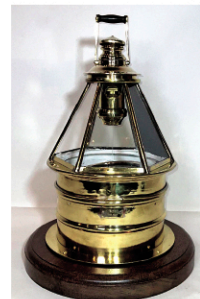
Lot 1 Skylight Yacht Binnacle Compass by E.S. Ritchie and Sons