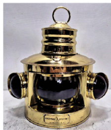
Lot 168 Solid Brass Boat Lantern by Perkins Marine