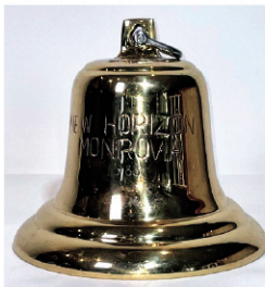
Lot 40 Ship's Bell from the "New Horizon" of Monrovia