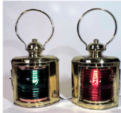
Lot 250 Solid Brass Port and Star- board Marine Lanterns