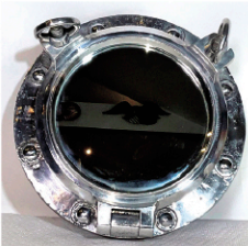
Lot 10 Porthole Mirror Mounted to a Teakwood Backboard