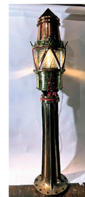
Lot 045A Magnificent Mar- itime Buoy Light on Pedestal