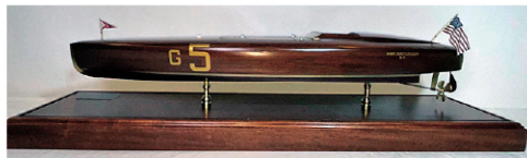
Lot 44 Baby Bootlegger

SAILING THROUGH HISTORY WITH A PREMIER MARITIME COLLECTION COLLECTORS' MARINE AUCTION: SHIP MODELS, LANTERNS, AND ARTIFACTS A RARE VOYAGE THROUGH MARITIME HISTORY — DISCOVER, COLLECT, AND CELEBRATE THE SEA.