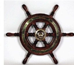
Lot 115 Ships Wheel by Simpson Lawrence of England