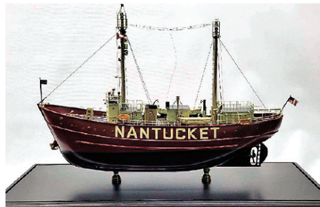
Lot 122 Nantucket Lightship model in case