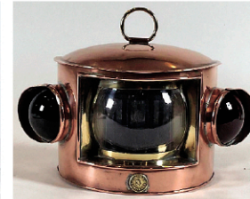
Lot 131 Yacht Lantern by Simpson Lawrence of England