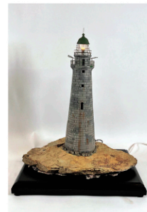
Lot 50a Scale Model of a Mi- not's Light Lighthouse