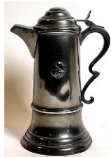
Lot 216 Mamaroneck New York Harbor Chart from 1901