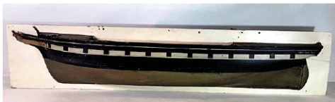
Lot 92 Builders Half Model of Packet Ship Kennington