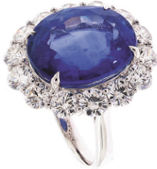
16 CT. Sapphire & Diamond Ring