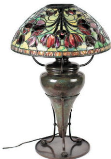
Tiffany Studios Crocus Lamp