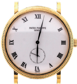
Patek Philippe Calatrava