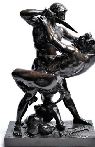
Antoine-Louis Barye Bronze