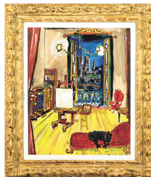
Ludwig Bemelmans Gouache