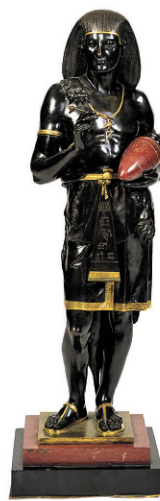
Emile Picault Bronze