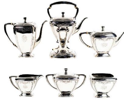
Whiting Sterling Tea Set