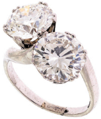
Toi Et Moi Diamond Ring