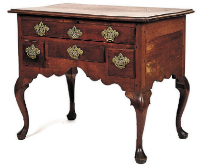
18th C. PA Dressing Table