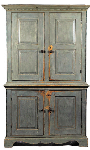
18th C. Painted Cupboard