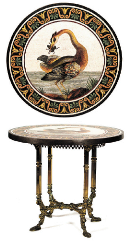
18th/19th C. Italian Mosaic Table