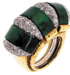
David Webb Diamond & Jade Ring