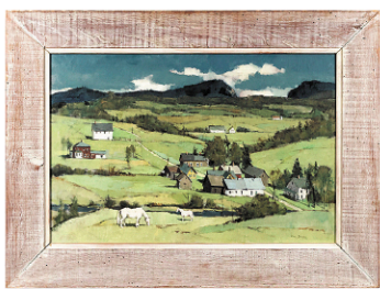
Paul Sample Oil, Two White Horses