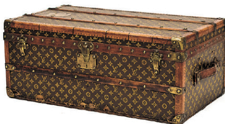
Louis Vuitton Cabin Trunk