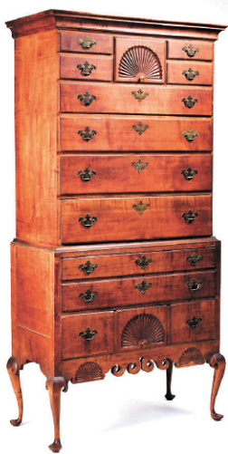
18th C. NH Dunlop Highboy