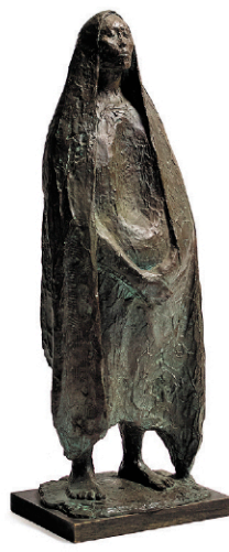
Francisco Zuniga Bronze