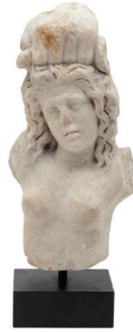
Ancient Roman Marble Bust of a Tritoness. The Austin Hills "Eclectic Collection" Auction Estimate: $4,000 / 6,000