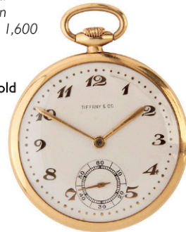
Tiffany & Co. 14k Yellow Gold Pocket Watch. May Gallery Auction Estimate: $400 / 600