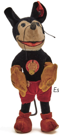
Vintage Steiff Disney Mickey Mouse Doll. May Gallery Auction Estimate: $1,000 / 1,500