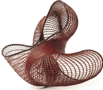
HONDA SYORYU (Japanese, born 1951) Woven Basket The Austin Hills "Eclectic Collection" Auction Estimate: $5,000 / 8,000