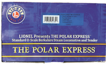
Lionel 6-84685 Polar Express Legacy Berkshire. May Gallery Auction Estimate: $1,200 / 1,400