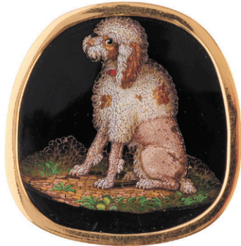
Attributed to Filippo Palizzi "Le Caniche Fuffy" Micromosaic, 18k Yellow Gold Pendant Brooch. May Gallery Auction Estimate: $5,000 / 7,000