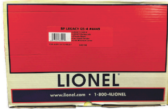
Lionel 6-83194 Southern Pacific Legacy GS-4 #4449. May Gallery Auction Estimate: $800 / 1,000

Over 100 lots new in box of O gauge trains.