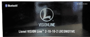
Lionel Vision Line 2131490 Santa Fe Black Bonnet. May Gallery Auction Estimate: $1,400 / 1,600