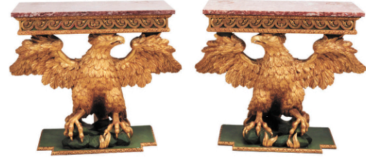
Pair of Marble Top Giltwood Eagle Console Tables. The Austin Hills "Eclectic Collection" Auction Estimate: $6,000 / 10,000