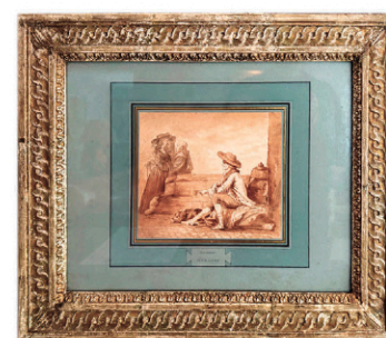
lot 1011 George Morland (English), titled "Ecole Anglaise", sanguine with wash