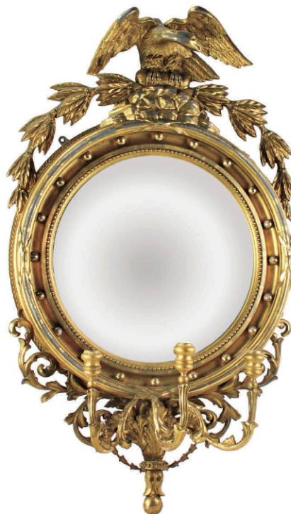
lot 1050 Early American convex eagle giltwood mirror