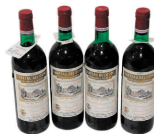
lot 155 (4) 750ml bottles of Chateau Bel Orme Medoc, 1979