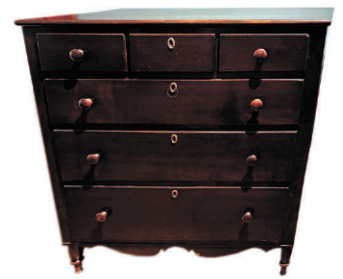
lot 1063 Antique Southern tall chest