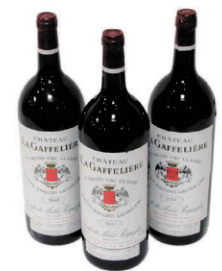
lot 96 (3) 1.5-liter bottles of Chateau La Gaffeliere Grand Cru St. Emilion