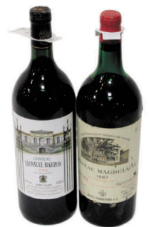
lot 99 (1) Chateau Magdelaine Grand Cru St. Emilion, (1) Chateau Leoville Barton St. Julien