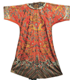
lot 1058 Important 19th century Imperial Chinese robe having elaborate gold thread with 5-claw dragons