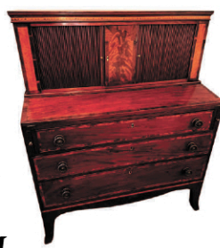
lot 1062 19th century Sheraton mahogany tambour desk

Preview: Monday-Sunday, June 2nd-8th, 9:00 AM-5:00 PM.