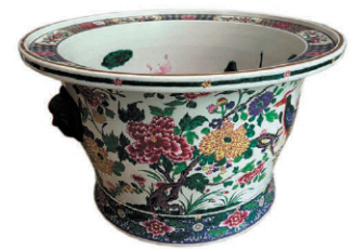
lot 1031 18th/19th century Chinese Famille Verte koi fish bowl