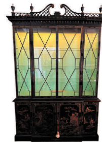
lot 1049 Antique English Chippendale japanned breakfront