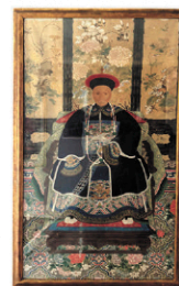
lot 1056 19th century Chinese ancestral portraits of Mandarin Emperor and Empress, paintings