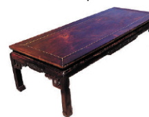
Hanghuali Chinese table