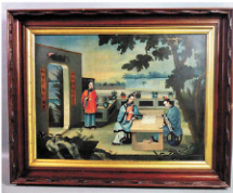
Fine Chinese painting (1 of 4)