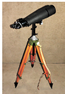
High power binoculars & telescopes