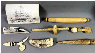
19th C. whalebone items