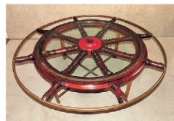
Ship wheel table