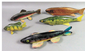
Several fish decoys