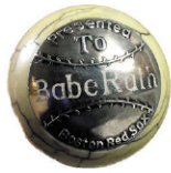
Babe Ruth cane