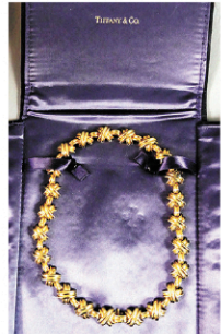
18k Tiffany necklace