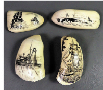
Scrimshaw whale teeth