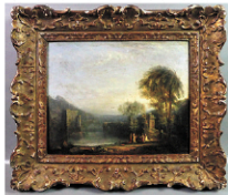
JMW Turner painting