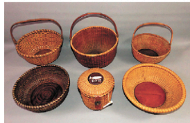
Collection Nantucket baskets