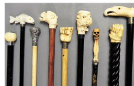
Collection of canes (over 150)