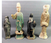
Early Chinese ceramics