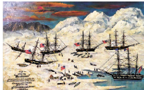
Arctic whaling painting