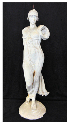
Plaster maquette by Daniel Chester French, Victory