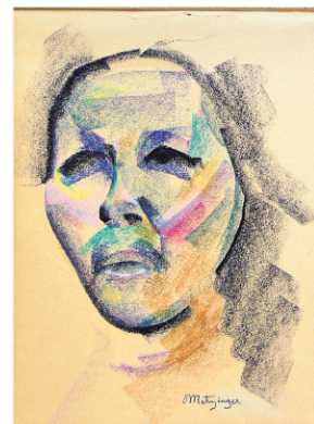
Drawing, signed Metzinger, from art collection