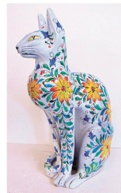
Large Italian ceramic cat

TERMS: cash, check, all major credit cards, wire transfer. In-house Buyer's Premium 28%, 3% cash or check discount. Wire fee 20 00 . ACH accepted. Sales Tax 8.125% unless NYS ST120 sales tax exemption is filed with us or purchases shipped out of state by certified shipper.