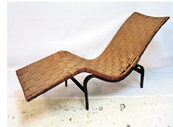
Bruno Mathsson lounge chair