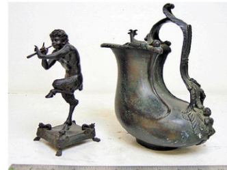
From a selection of bronzes