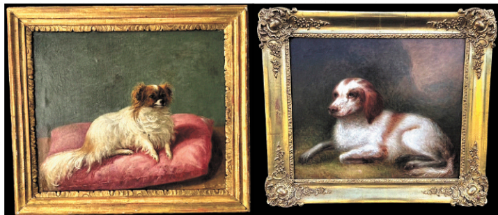
Antique Dog portraits (one with Ruben De Saavedra label)

and link to Auction Zip for photos and descriptions.