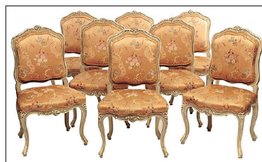
8 Louis XV style carved and painted dining chairs with silk upholstery