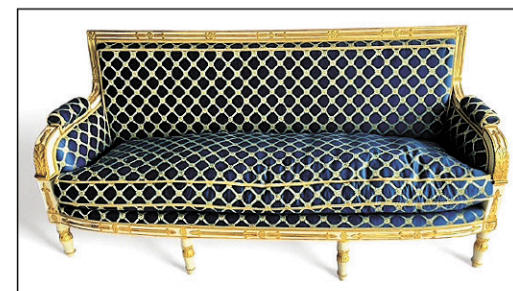
Neoclassical style cream painted and gilt parcel sofa with cobalt geometric custom upholstery