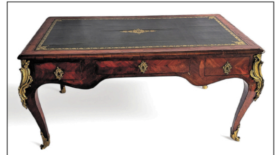
19th C Louis XV Kingwood bureau plat writing desk