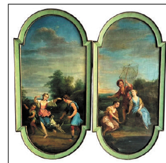
Continental oil paintings with old Christie's label 38" x 18"