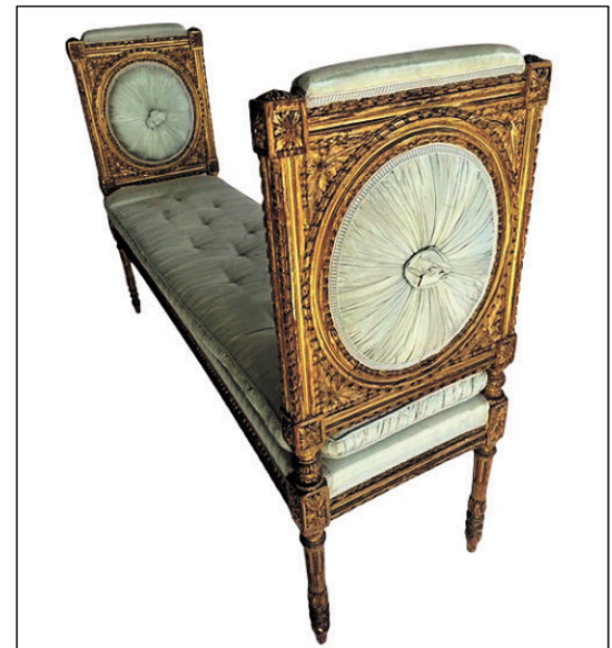
Antique carved gilt French window bench with silk tufted button upholstery (52" L)