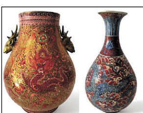
Asian porcelain lots from storage locker room