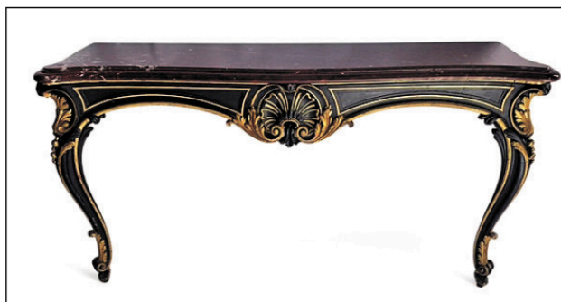
Pair of Louis XV style carved and painted console tables with rouge marble tops