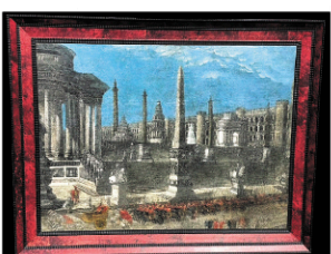
Oil on canvas of Ruins with Chariot procession (has Ruben de Saavedra label) (33" x 45")