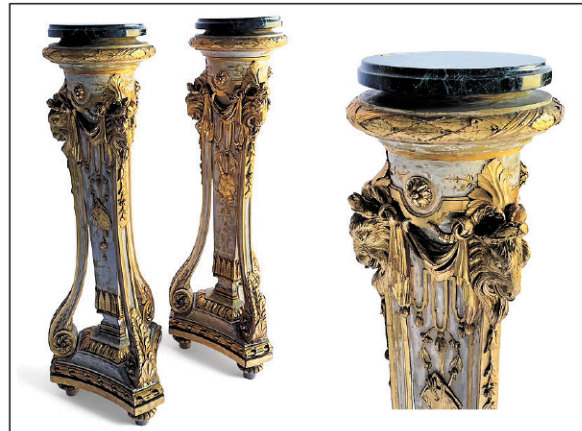
Highly decorative Louis XVI style painted and gilt marble top pedestals with carved ram's heads