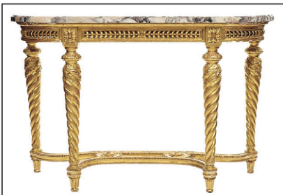
Marble Top French gilt carved console table (54" L)