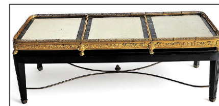
French gilt coffee table with inset marble