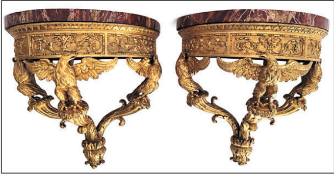
Exceptional Gilt 19th C hanging marble top consoles with carved eagles