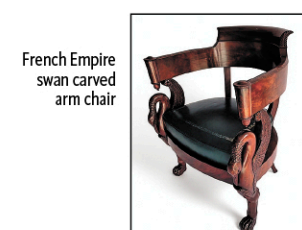
French Empire swan carved arm chair