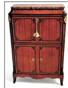
Satin and Rosewood inlaid marble top Abattant desk