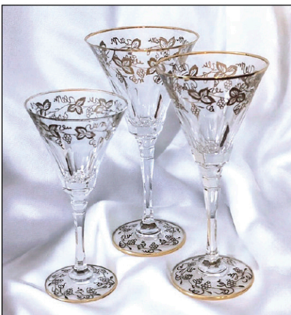
Saint- Louis gold encrusted blown crystal stemware (3 sizes of 12 each)