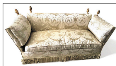
Lovely custom upholstered sofas and chairs including Knole style with pineapple finials