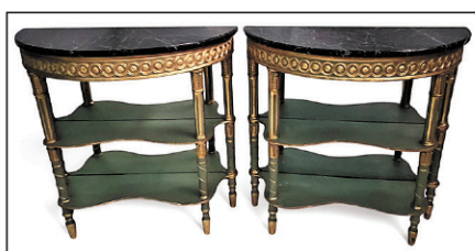
19th C parcel gilt French marble top mirrored console tables