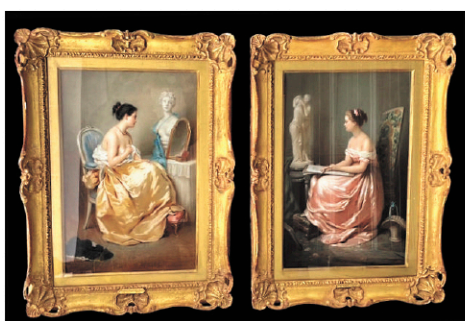
Pair of gouache portraits of young ladies signed Constant Joseph Brochart "Bond Street Galleries" (19.5 x 12.5)