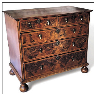
George I 18th c Walnut chest