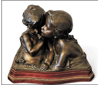
French bronze sculpture "Sisters" Henri Perrot