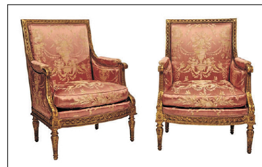
French gilt carved 19th C Louis XVI style Bergere chairs