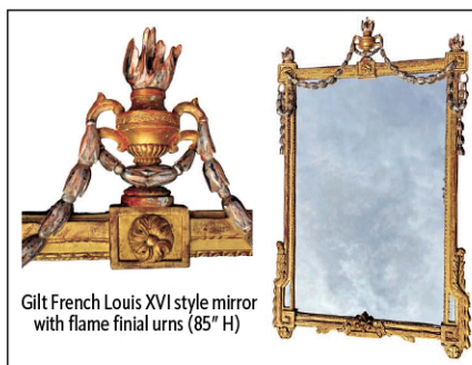
Gilt French Louis XVI style mirror with flame finial urns (85" H)