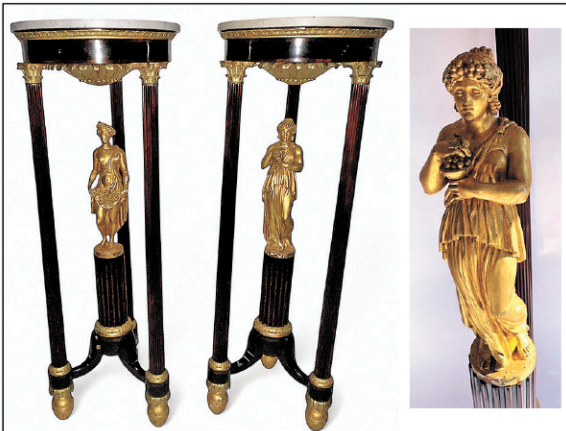
Elegant 19th C French Empire style antique mahogany and rosewood marble top pedestals with classical female gilt figures and ormolu decoration 53" H