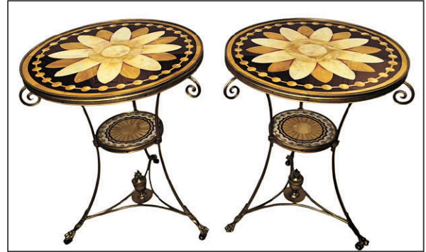
Pair of 19th C French Louis XVI ormolu mounted Gueridon tables with beautiful inlaid marble tops