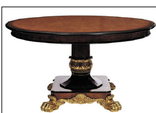
Continental mahogany and burlwood parcel gilt center table (52" Diameter)