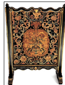
Antique needlepoint tapestry firescreen