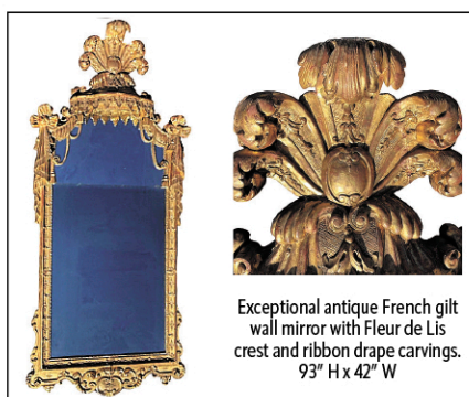
Exceptional antique French gilt wall mirror with Fleur de Lis crest and ribbon drape carvings. 93" H x 42" W