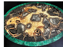
19th C Continental specimen marble top carved giltwood console table