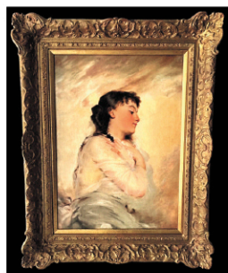
Oil Portrait of young woman in gilt frame