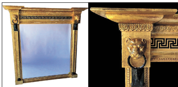
Gilt Grecian style mirror with Lion heads (60" H x 66" L)