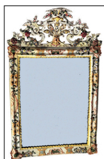
Venetian Antique mirror (54" H x 34" W)