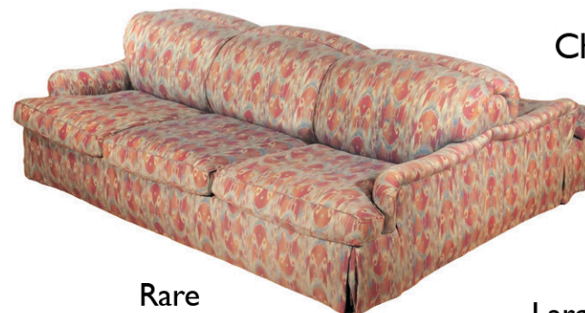
Rare George Smith Double Sided Sofa $2,000-4,000