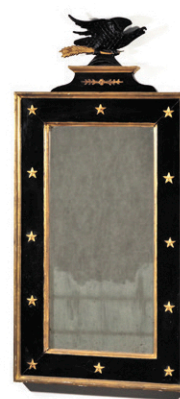
Black & Gilt Mirror With Cast Iron Eagle $500-700