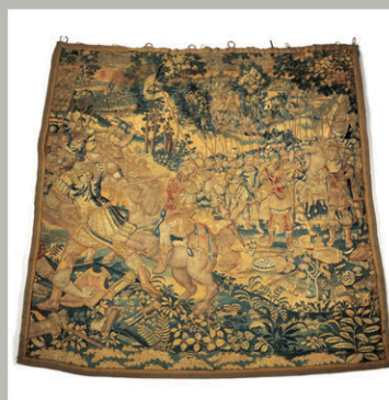
17th C. Verdure Battle Tapestry | Sold $5,500