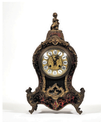
Japy Freres Boulle Shelf Clock $200-400