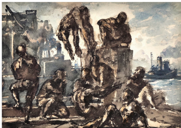
Reginald Marsh (American, 1898-1954) Charcoal and ink on paper $3,000-5,000