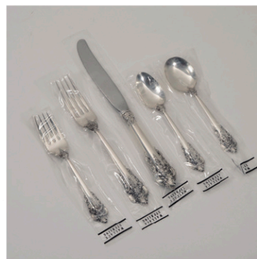
[New] (118pc) Wallace Sterling Flatware Service $3,000-5,000