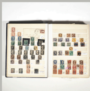
Early American Stamp Collection | Sold $7,000