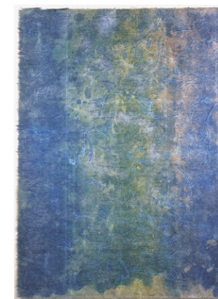
Sam Gilliam (1933-2022) Monoprint $4,000-6,000