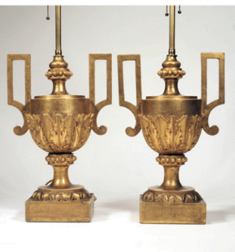
Pair 18th/19th Century Gilt Carved Urn-Form Lamps | $700-900