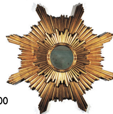
Large Giltwood Double Sunburst Mirror | $1,000-1,500