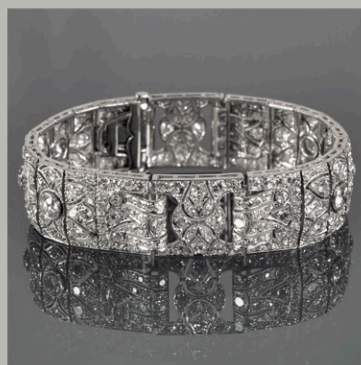
French Art Deco Bracelet | Sold $11,000