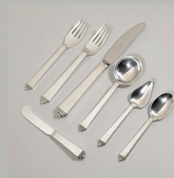
Georg Jensen Pyramid Flatware | Sold $7,000