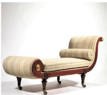
A Fine Georgian Scroll Chaise Lounge $4,000-6,000