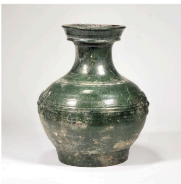
Chinese Antique Green Glazed Vase $2,000-4,000