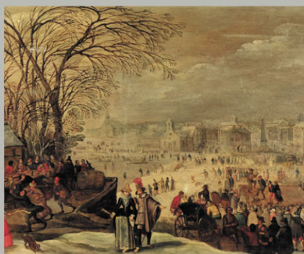
Hendrick Avercamp (1585-1634) | Sold $36,000