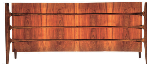
William Hinn "Exoskeleton" Chest of Drawers | $4,000-6,000