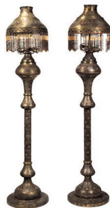
Fine Moorish Mixed Metal Floor Lamps $500-1,000