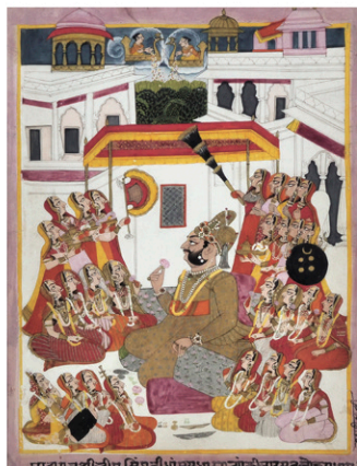
1803 Indian Illustration of Maharajah Bhim Singh $400-600