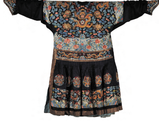
18th Century Court Audience Robe