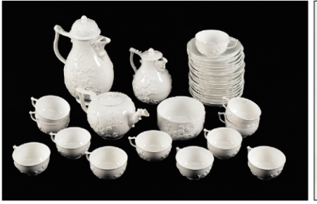
Several Meissen Porcelain Sets