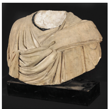
Roman Imperial Life-Size Bust

Bid live in-person at our gallery, or online at Tremontauction.com • LiveAuctioneers • Invaluable