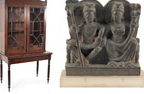
New York, 1810 Gandharan, 2nd Century BC