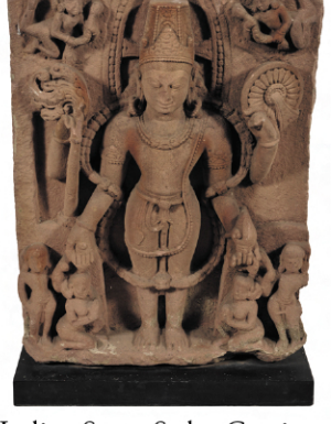
Indian Stone Stelae Carvings