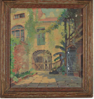
Clarence Millet, New Orleans