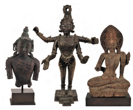
Early Indian Sculptures