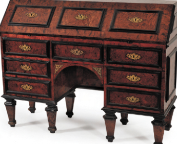
18th Century Baroque Des