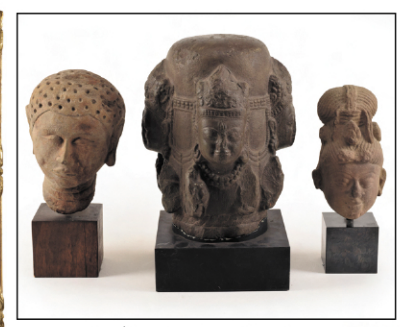
Indian Stone Carvings