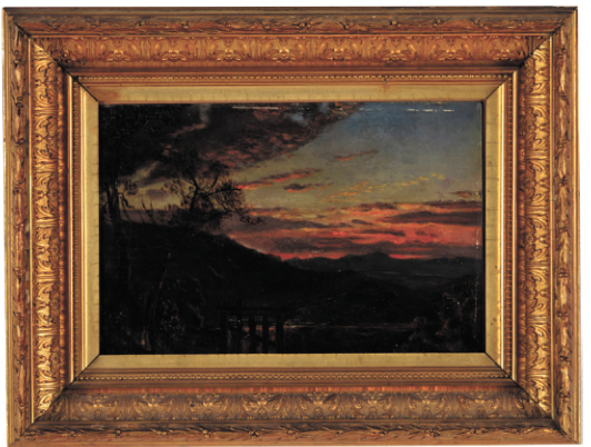
Labeled View of Lancaster, NH