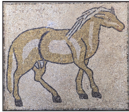
Large Late Roman Mosaic