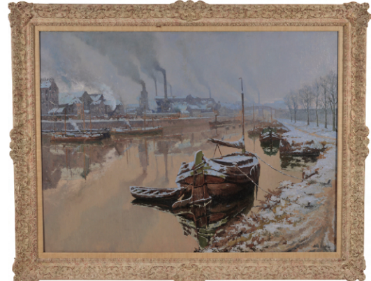
Paul Leduc, 1911 Salon Size