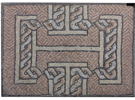
Geometric Late Roman Mosaic