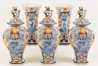
18th-19th Century European Ceramics