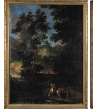
Old Master Paintings