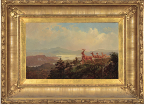
Otto Sommer, 1850s Chicago Studio