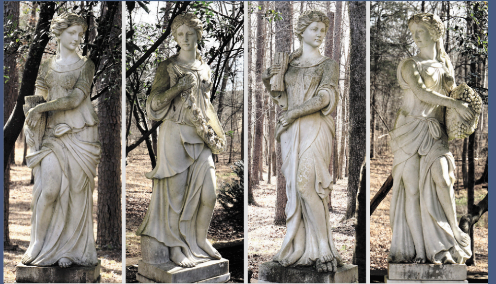
Set of Four Classical Style Carved Marble Statues of the Four Seasons