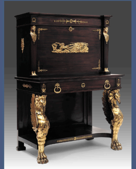
Napoleon III Style Mahogany and Ormolu Abattant, circa 1900