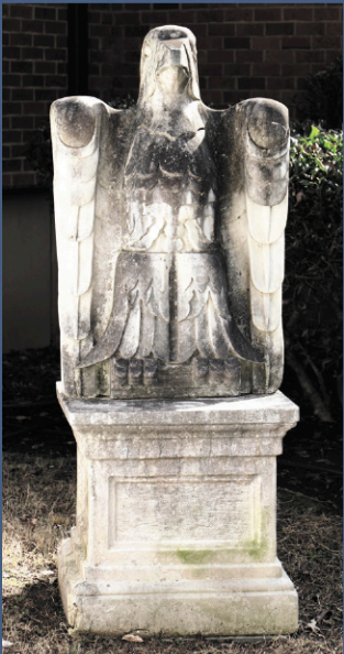
Large Art Deco Style Carved Marble Statue of an Eagle