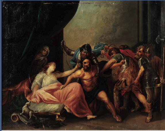
after Sir Anthony van Dyck (Flemish, 1599-1641), Samson and Delilah