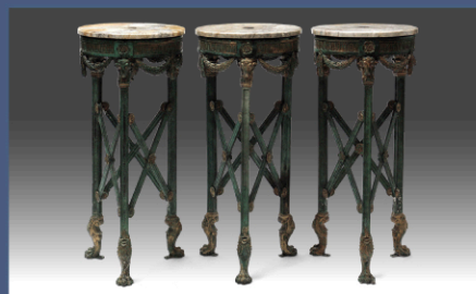
Set of Three Directoire Style Marble Top and Gilt Bronze Tall Gueridon, early 20th c.