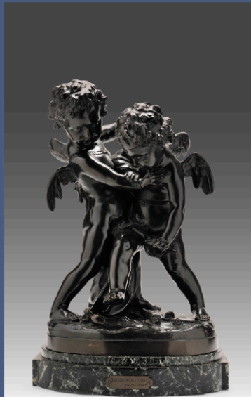
after Etienne Maurice Falconet (1716-1791), La Lutte Pour le Coeur