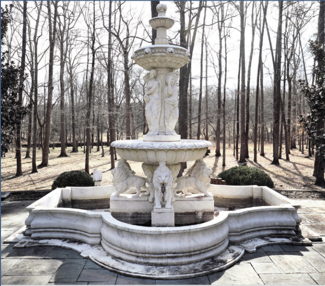
Impressive Belle Epoque Style Carved Marble Figural Garden Fountain