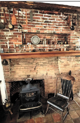
A peek inside the Jaffrey, NH estate