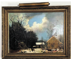
Wonderful artwork from the Jaffrey, NH estate incl this 19thC oil on canvas of a homestead in winter scene

LIVE PREVIEW: MARCH 14TH – MARCH 23RD from 10am-5pm • 867 Route 12 Westmoreland, NH 03467