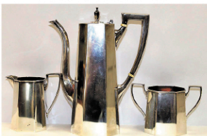
Cartier sterling silver tea set