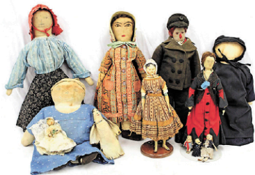
Superb collection of antique rag dolls plus nice papier mache & Native American examples