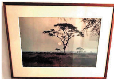
Showing just one of many of the fantastic framed photographs taken in the African Safari