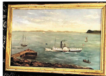
Wonderful artwork from the Jaffrey, NH estate incl this o/bd marine example