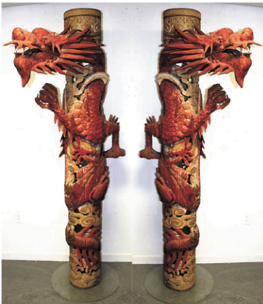
Impressive 6ft tall carved wood & painted dragons