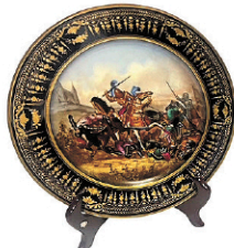
Pair of Sevres ornate cabinet plates