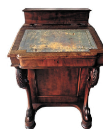
English 19th C carved Davenport desk