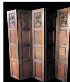
Five panel oak screen with carved fruit motif