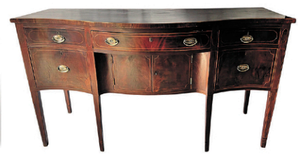
Antique American inlaid mahogany sideboard