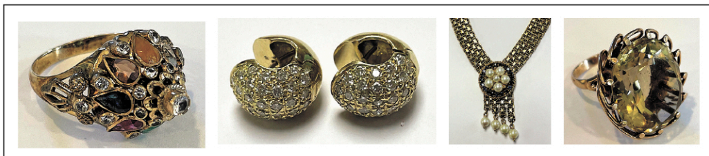
Fine 14k and 18k jewelry