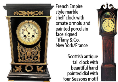
French Empire style marble shelf clock with ornate ormolu and painted porcelain face signed Tiffany & Co. New York/France