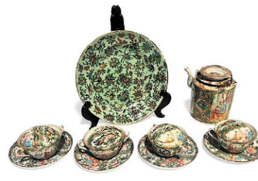
Chinese porcelain lot