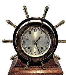
Chelsea Ship's clock