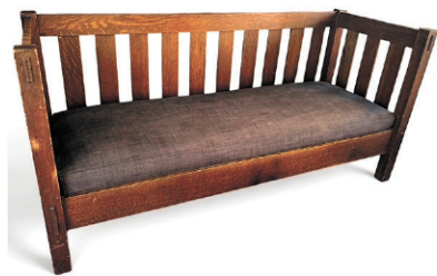
Lifetime Furniture Mission oak even arm settle