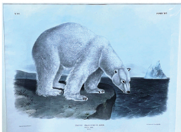
Audubon Imperial Folio Polar Bear No 91 XCI JT Bowen edition 1846