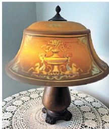
Reverse painted table lamp with horses and urn