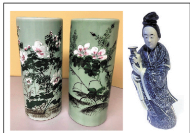
Asian Pottery and Porcelain