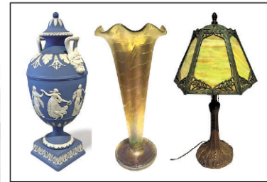
Estate Accessories including 23" Art Glass vase