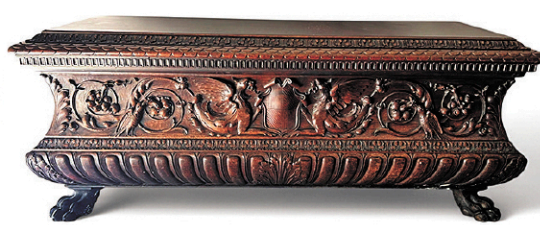
Carved cassone signed Davenport, Boston with elaborate winged griffins, birds and carved shields