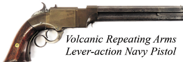
Volcanic Repeating Arms Lever-action Navy Pistol