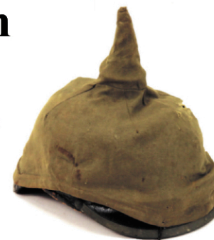
WWI German Baden Model 1915 Pickelhaub and Cover