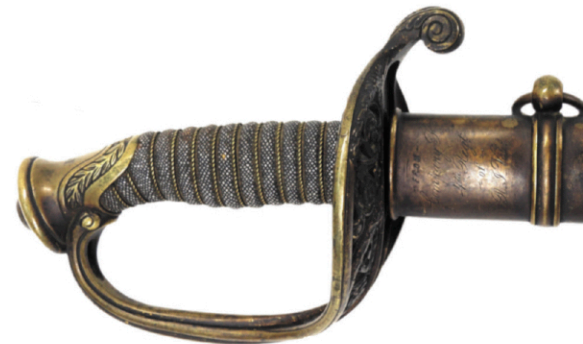
Model 1850 Foot Officer's Sword Identified to Lt. George E. Curtis, 4th Rhode Island Infantry

508-434-7223 info@blackstonevalleyauctions.com