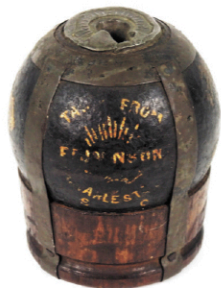
Six-pound Shell and Sabot from Ft. Johnson, South Carolina