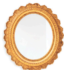
Mirror in Antique Carved Gold Frame