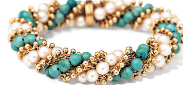
Van Cleef & Arpels Iconic "Twist" Bracelet in 18K Gold with Pearls and Turquoise