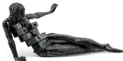
Salvador Dalí "Le Cabinet Anthropomorphe" Signed Bronze Sculpture