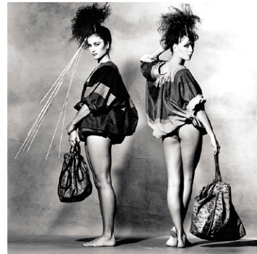
Irving Penn Original Photography Vintage Gelatin Silver Print, Signed