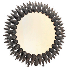
Line Vautrin Sun Mirror in Blackened and Hammered Metal, 20th Century

Welcome to our premier auction event, showcasing an exceptional array of art, sculpture, furniture, Asian works, decorative items, and jewelry from distinguished artists and collections. Here's a glance at what to expect: