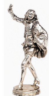
Adrien Étienne Gaudetz Silvered 20" Bronze Art Nouveau Dancer Sculpture, Circa 1900