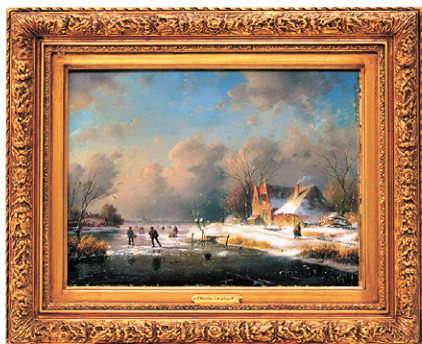
Charles Leickert Oil Painting, titled "Skating on a Frozen River", 19th C.