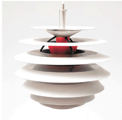
Poul Henningsen "PH Contrast" Suspension Lamp for Poulsen