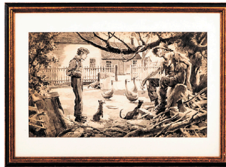
Everett Shinn Signed Pen and Ink Watercolor Drawing Painting, Farmyard Scene, 1942