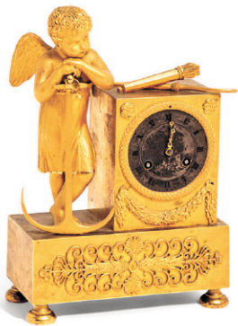
Empire Period Gilded Bronze Cherub Clock with Anchor and Quiver