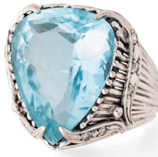
Aquamarine and Diamond 18K White Gold Ring