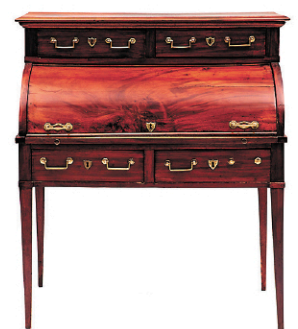
English Flame Mahogany Cylinder Roll top Desk, 19th Century