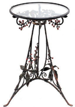
Art Nouveau French Wrought Iron Tall Table Flower Stand, Circa 1900