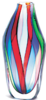
Exceptional Signed 15" Murano Art Glass Vase, 20th Century