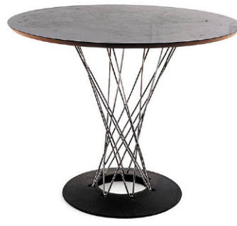
Modernist Modernica Cyclone Round Dinner Table, 20th Century