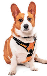
Baccarat Signed 30" tall Gilt Bronze and Crystal Urn, Early 20th Century (Dog not included)