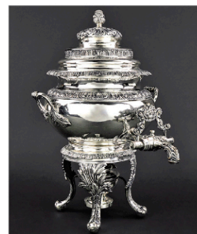
Baldwin Gardiner NYC Coin Silver Water Urn