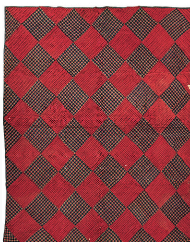
Early 19th c Pieced Linsey-Woolsey