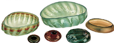
Dale Chihuly (AM 1941-) Seaform Suite