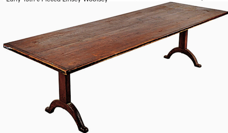
Rare 19th c 8 1/2 FT Shaker Meeting House Table