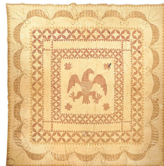
Early 19th c Stuffed-Work Quilt with Federal Eagle