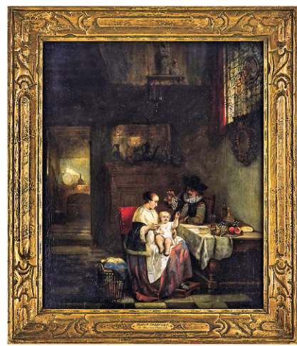
17th c Dutch interior on panel