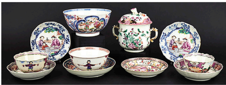
Collection 18th c Chinese Export