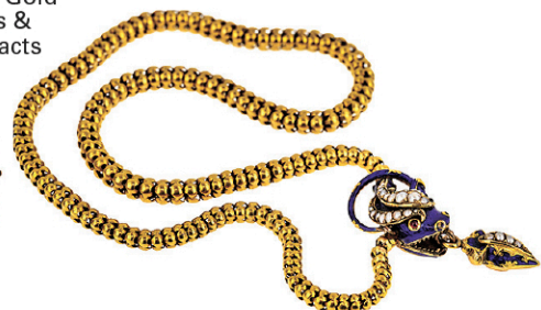
Antique Yellow Gold & Enamel Snake Necklace