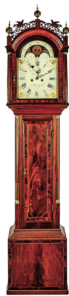
N Monroe Concord MA Tall Case Clock