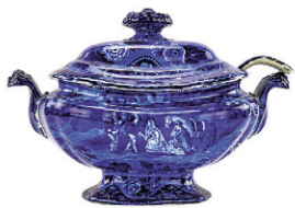
Deep Blue Staffordshire Porcelain Tureen