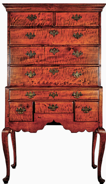
18th c N.E. Queen Anne Tiger Maple Highboy