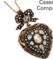
Antique 4 CT Old Mine Cut Diamonds & Gold Locket