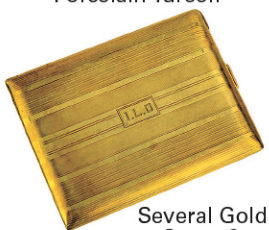
Several Gold Cases & Compacts

137 JAMES BROWN DRIVE, WILLISTON, VERMONT