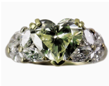
lot 520 18k Gold and Heart-Shaped Yellow Diamond Ring