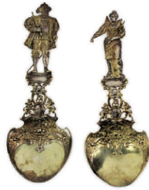
lot 577 Pair of .800 Silver Antique Spoons