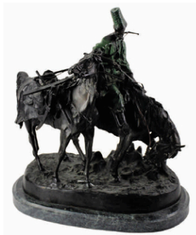
lot 166 Russian Bronze Sculpture of Cossack on Horse