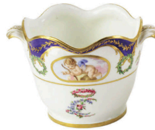
lot 809 Pair of Sevres achepots, attributed as made for Princess Louisa, 4 1/8" x 6 1/4".