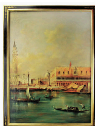
lot 659 19th/20thC Italian, Canal View in Venice