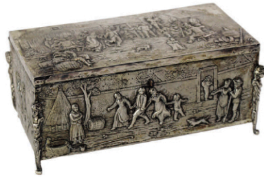
lot 578 Antique Silver Repousse Box, 4 1/4" H x 9 1/2" W x 5" D. Approximately 31.5 troy oz TW.