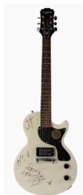
lot 672 Red Hot Chili Peppers Signed Epiphone Guitar