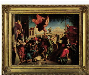
lot 645 Attr to Jacopo Robusti, The Miracle of the Slave