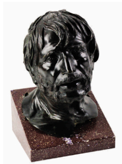
lot 704 Bronze Head of Philosopher Lucius Annaeus Seneca