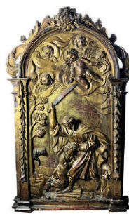
lot 702 17thC Italian Carved Gold Giltwood Arched Relief