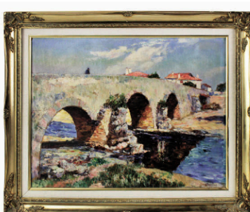
lot 220 Louis Floutier, Arched Stone Bridge