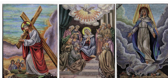
lot 200 Set of Glass Mosaic Panels with Religious Scenes