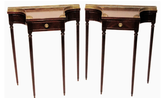
lot 78 Pair of Mahogany Single-Drawer Galleried Stands