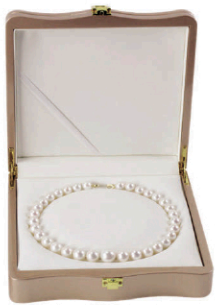
lot 523 South Sea Fancy Graduated Pearl Necklace, 18k Clasp