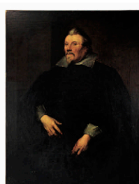
lot 701 17thC Dutch, Portrait of Bearded Man