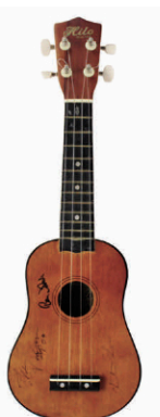
lot 674 Hilo Ukulele, Signed by Beach Boys Members