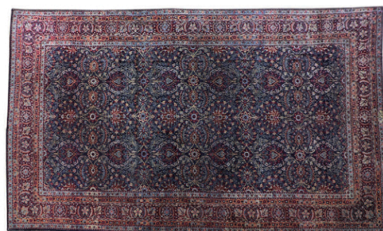
lot 650 Antique Persian Lavar Kerman rug, 17' 9" x 9' 5".