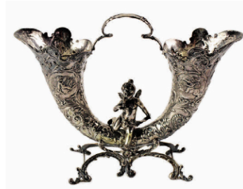
lot 575 Ormate Silver Renaissance Revival Double Vase