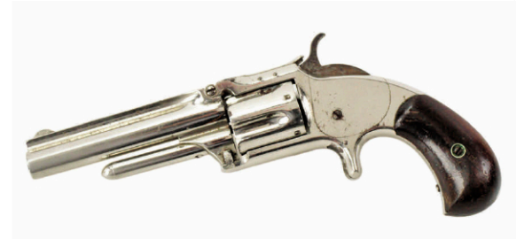
lot 80 Smith & Wesson, Springfield, Massachusetts, five-shot revolver, pat. Nov 21, 1865.