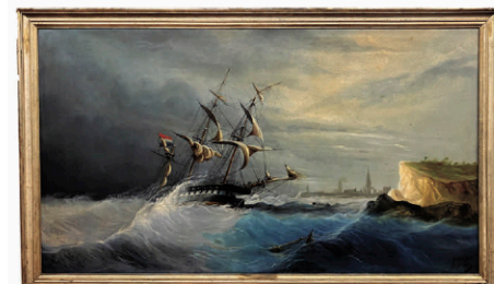
lot 651 C. Dubreuil, French Ship in Storm, Oil on Canvas