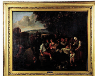
lot 652 18thC Oil on Canvas, Flemish Festival