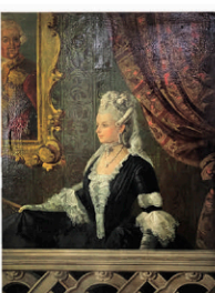
lot 699 17th/18thC, Portrait of Woman on Balcony