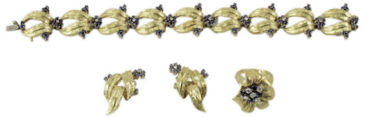
lot 518 Suite of 14k (tested) Yellow Gold Diamond Sapphire Jewelry, to include; bracelet, 7 1/4" L (marked 18k but tests 14k); clip earrings, 1 1/8" H; ring, size 3 1/2. Approximately 75 grams TW.