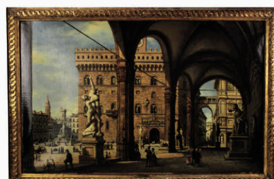
lot 658 Consalvo Carelli, View in Florence, Oil on Canvas