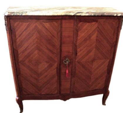
lot 160 French Marquetry Marble-Top Two-Door Cabinet