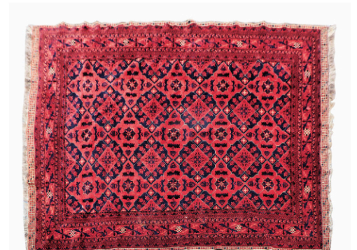
lot 735 Fine Turkoman rug, 9' 6" x 6' 7".

Consignments now invited, contact consignments@kaminskiauctions.com