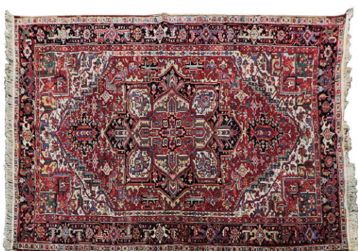
lot 655 Antique Persian Heriz rug, 11' 4" x 7' 11".