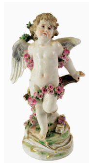
lot 773 Meissen Figure of Cupid