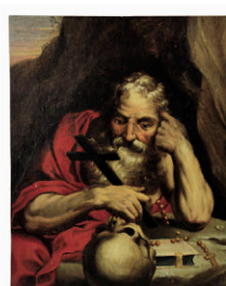
lot 696 18thC Flemish School, St. Jerome