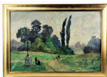
lot 656 Lucien Gilbert Darpy, Landscape with Figures