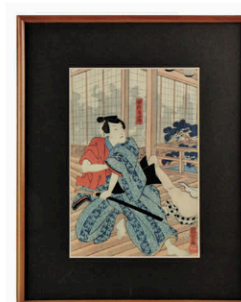
lot 396 Kuniyoshi, Kabuki Actor, Colored Woodblock