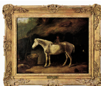
lot 161 George Morland, Man with Horse and Dog