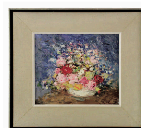
lot 310 French Canadian Floral Still Life, Oil on Board

Consignments now invited, contact consignments@kaminskiauctions.com