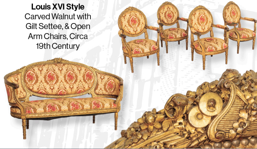
Louis XVI Style Carved Walnut with Gilt Settee, & Open Arm Chairs, Circa 19th Century