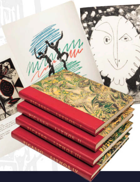
Pablo Picasso (Spanish, 1881-1973) Lithographs, "Picasso Lithographe" 4 Volumes