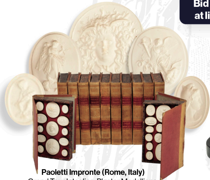
Paoletti Impronte (Rome, Italy) Grand Tour Intaglios, Plaster Medallions, 12 Volumes, Circa. 1840, 369 pcs