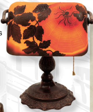
Nien (France) Art Glass Cameo Desk Lamp, Ca. 1940