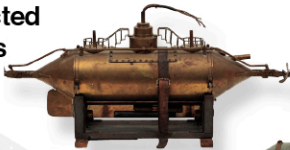
Four Lots of Hand Constructed Brass Model Submarines Ca. Mid 20th Century