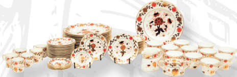
Royal Crown Derby (English) Bone China Partial Dinner Service, 62 Pieces "Asian Rose Pattern"