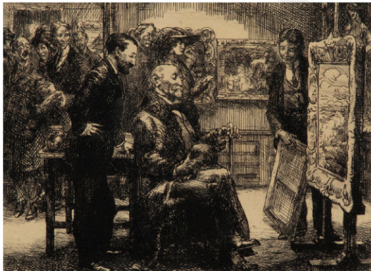
John Sloan (American, 1871-1951) Etching, 1911, "The Picture Buyer"