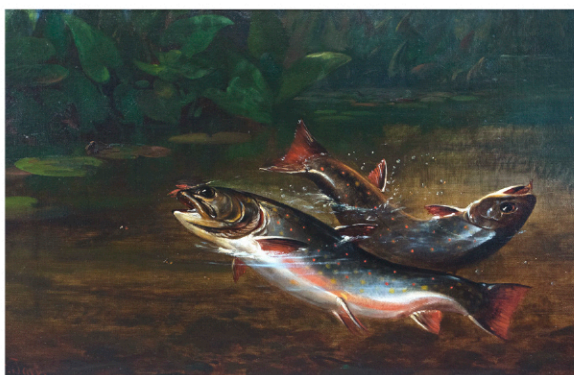
Arthur Fitzwilliam Tait (1819-1905), An Anxious Moment , oil on canvas, 14 by 22 ¼ in., no. 25 in Tait's registry