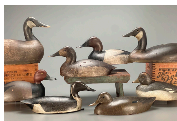
The George Secor Decoy Collection to Benefit Delta Waterfowl