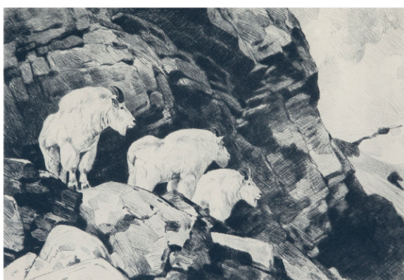
Carl Rungius (1869-1959), Three Old Gentlemen , etching and drypoint, 7 ¾ by 10 ¾ in., 1 of 5 Rungius etchings