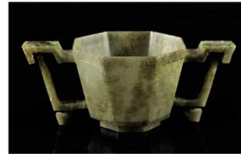
17th Century Celadon