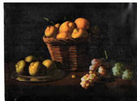
Old Master Paintings