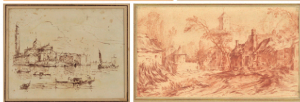
Old Master Drawings