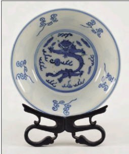
Chinese Ming Bowl