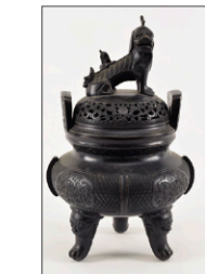
19th.C. Bronze Censer