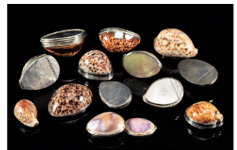
Silver Cowrie Shells