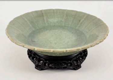
Ming Celadon with Dragon