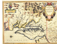
Early New World Maps