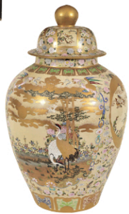
Monumental Urn Satsuma 35 in.