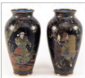
Attrib. to Namikawa 14 in.