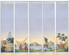
13 Zuber "Hindustan" wallpaper panels