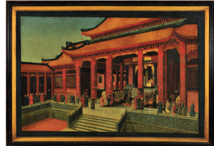
Important Large Chinese Export Painting

Join us for this important single owner sale of 315 eclectic lots, featuring a wide range of works of art from Old Masters, British and American 19th & 20th Century, Chinese Export, Early Maps, Native American and Contemporary. A variety of fine accessories will include historical objects, Asian ceramics and enamel ware, Art pottery and important ceramics. Catalog online. Bid at our website, in person at the gallery, or at liveauctioneers.com invaluable