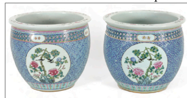
19th.C. Chinese Large Planters