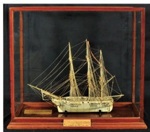
1812 P.o.w. Ship model & John Adams 1st London Edition Adams Family Provenance