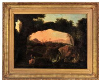
Old Master Paintings