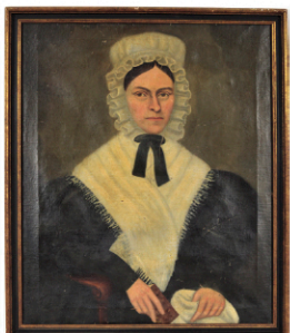
Erastus Salisbury Field