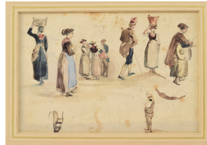
Richard Parkes Bonnington