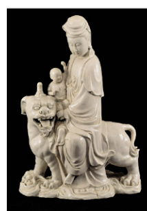
Dehua Guan Yin 21 in.