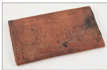
Rare 1772 Salem, embossed leather billfold