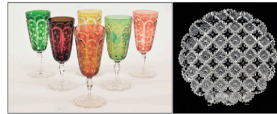
Selection of Cut Glass