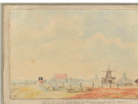
Cornelis Pronk, Old Master Drawings - Amsterdam