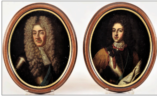
Pair of Late 17th.C. Portraits