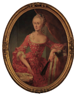
Old Master Paintings