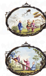
Chinoiserie Enamel Plaques