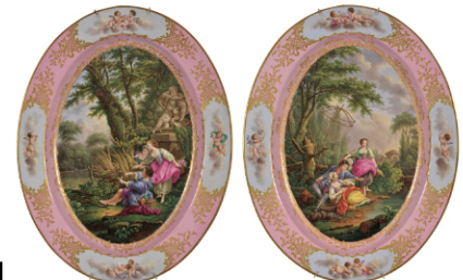
Important 20 in. Flight, Barr & Barr