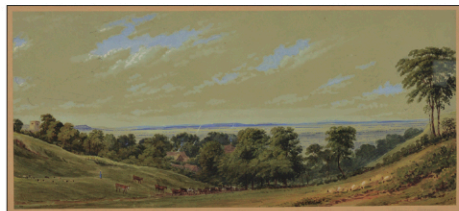
William Turner of Oxford