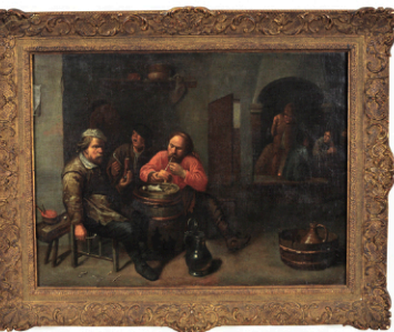
D. Ryckaert. 17th Century