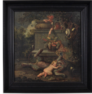
Old Master Dionysus as child