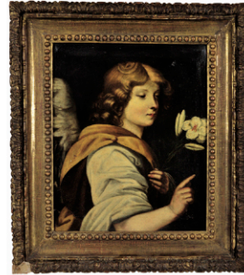
17thC Italian old master