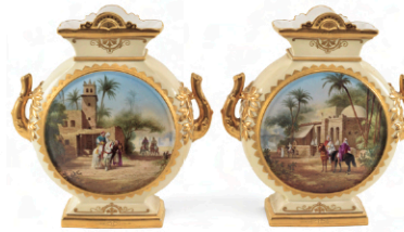
Paris Porcelain, Orientalist