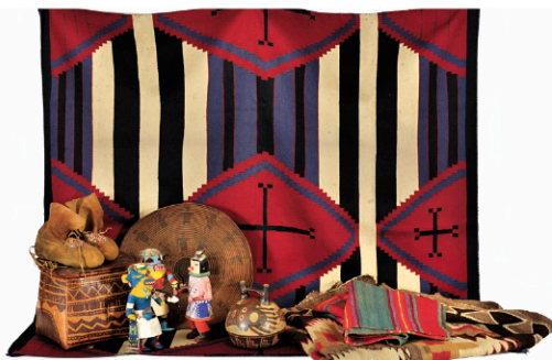
Native American Items