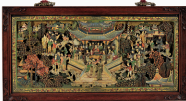
19th.C. Chinese Carved Panel