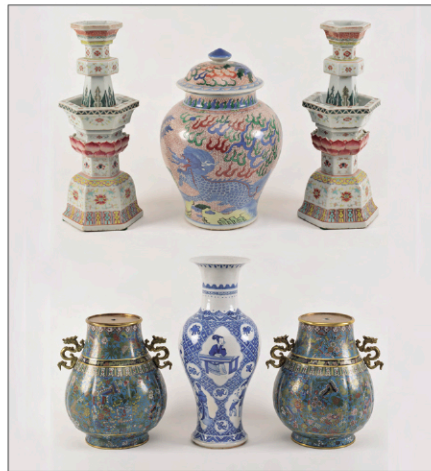
Chinese Porcelain & Cloisonne Vases 12 inch