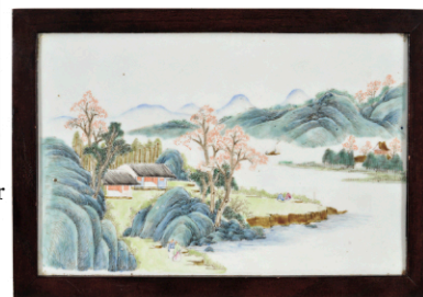
Late 18th.C. Chinese Plaque