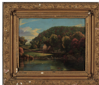
Early Hudson River

www.tremontauctions.com 615 Boston Post Road Sudbury Ma, 01776 Ma Lic #648 Tel. 617-795-1678 · info@tremontauctions.com