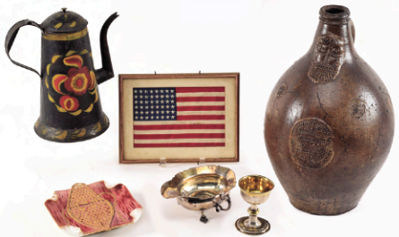
Amelia Earhart Flag 17in. Bellarmine jug