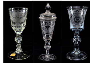
18th Century Stemware