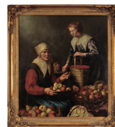
Old Master Paintings