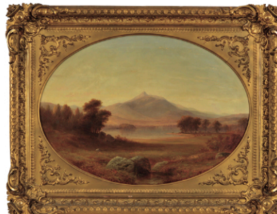
Benjamin Champney 1856 Large Mt. Chocorua