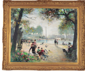
Jules Herve, 32 x 39 1/2 in.