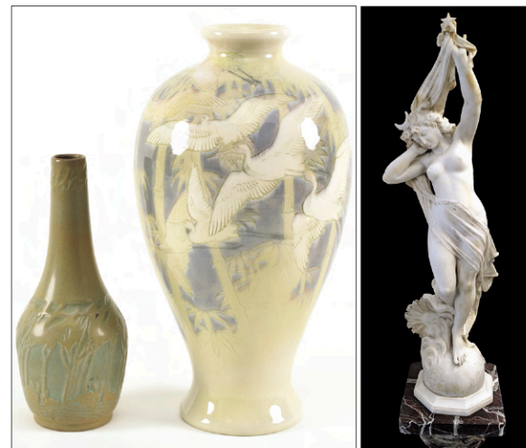
Overbeck & Rookwood 12 in.