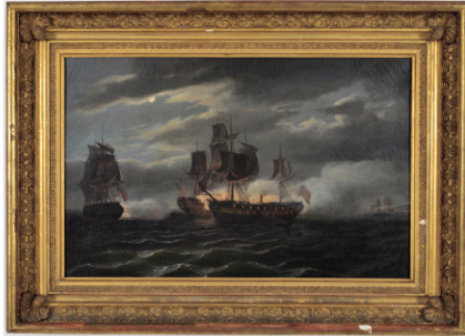
Early 19th.C. USS Bonhomme Richard