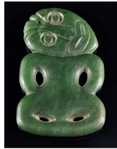
Maori Hei-tiki pendant