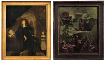
Old Master Paintings