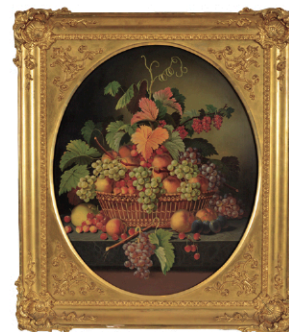
Roesen Style Still Life