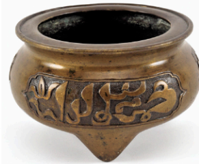
17th.C. Chinese-Arabic Censer