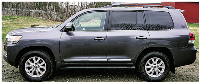
2017 Toyota Land Cruiser 57,000 miles

Merrill's Auctioneers and Appraisers is pleased to offer outstanding Early American & Country Furniture and Accessories from a South Burlington, VT collection; as well as Paintings, Prints, Oriental rugs, Glass, China, Silver, Jewelry, and accessories from area homes.