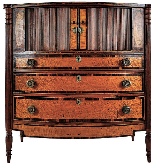
Ca. 1820 Rutland, VT Federal Tambour Half Sideboard