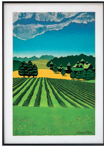
w/c & Mixed Media Sabra Field (b. 1935) Shelburne Farms, VT