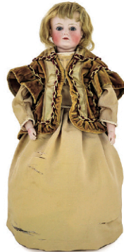
19" Kestner XI Bisque Socket/ Shoulder Head Doll