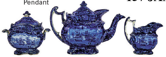
McDonough's Victory Historical Staffordshire Tea Set