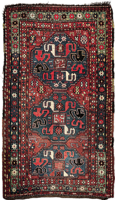
19th c Cloud Band Kazak Carpet