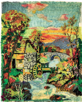
Grandma Moses Original Needlework Landscape