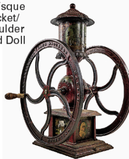
Lane Bros. Swift Mill #15