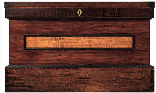
Fine inlaid 19thc Am. Tool Chest