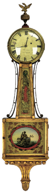
Aaron Willard Presentation Banjo Clock