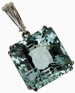
27 CT Aquamarine Pendant

MERRILL'S AUCTION GALLERY 137 JAMES BROWN DRIVE, WILLISTON, VERMONT