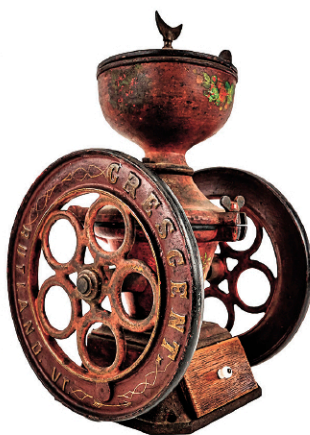
Crescent #5 Coffee Grinder