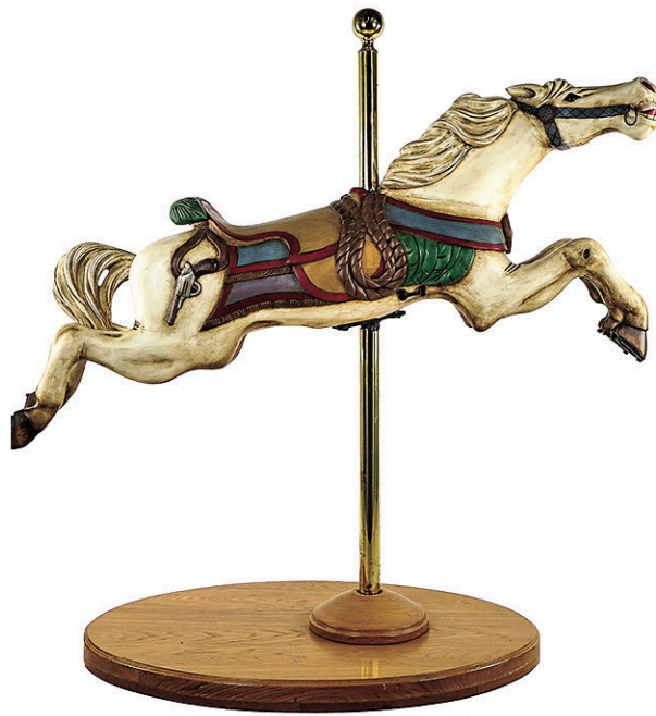
Ca. 1920 C.W. Parker Carousel Horse