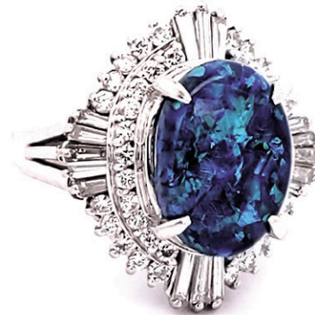
Lot 39 Black Opal and Diamond Ring