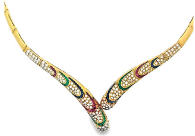
Lot 44 Italian Sapphire, Emerald, Ruby and Diamond Necklace

Online bidding at liveauctioneers and bidsquare • Bid in person on site, on the phone or left bids accepted