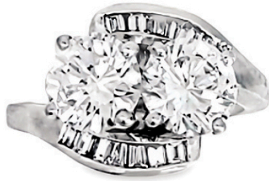
Lot 53 Twin Stone Diamond Ring