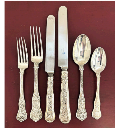
Lot 127 Tiffany and Company Olympian Flatware set