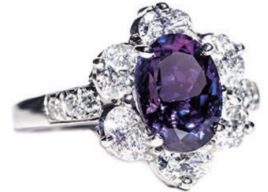
Lot 65 Oscar Heyman Alexandrite and Diamond Ring