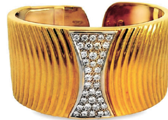
Lot 16 Sal Praschnik Diamond and Gold Cuff