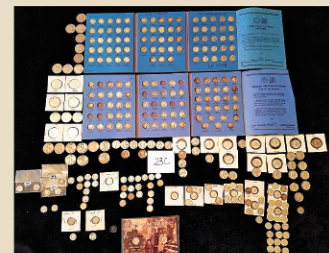
Estate 90% US Silver Coin Collection plus others Lot 23C plus others