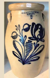
R. Harrington Lyons, NY Five-Gallon Butter Churn plus 50 other Decorated Stoneware lots Lot 4S & others