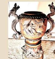
Six-Piece Antique Oriental Bronze Dragon Incense Pot Lot 170