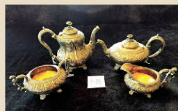
English Sterling Repousse Tea Set Lot 1B.jpg