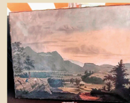
Monumental 1860s Oil on Canvas Painting possibly Chambers Lot 105