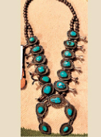
Antique Native American Silver Squash Blossom Turquoise Necklace Lot 149