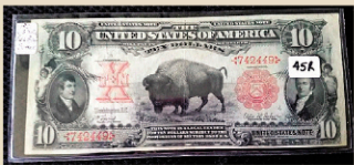
Rare 1901 $10 Buffalo Legal Tender Note plus others Lot 45R