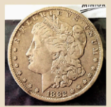
1882-CC US Morgan Silver Dollar plus 100s of other Silver Dollars and Coins Lot 21R & others