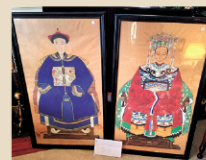
Exceptional Pair of Hand Painted Oriental Paintings with damage (see photos) Lot 3B.jpg