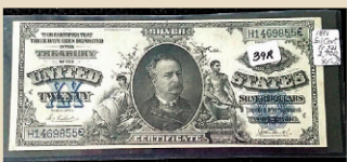
Rare 1891 $20 US Silver Certificate Lot 39R