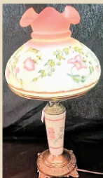
Fenton Burmese Lamps plus 50+ other Fenton Pieces Lot 1F & others