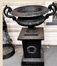
Pair of Iron Matching 44" high, 19th-c. Two-Part Jardinieres Lot 185