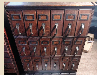
York Oak Three-Section 18-Drawer Cabinet & others Lot 1101