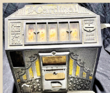
Pace 1c Coin-Operated "The Cardinal" Aluminum Gum Machine Lot 1037