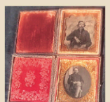
4 Civil War Tintypes plus 400 other Tintypes Lot 1137 & Others