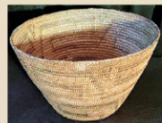
Antique Native American Basket Lot 226