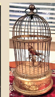
19th-c. Automaton Bird in Brass Cage Lot 233