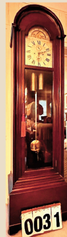
Excellent Waltham, Mass. Grandfather Clock plus other Clocks Lot 31