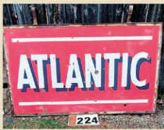
Atlantic Large Enamel Porcelain Gas Sign plus others Lot 224