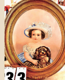
1860s Oil on Canvas of a Girl with her Dog Lot 33