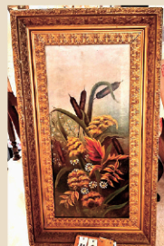
Excellent 19th-c. Oil on Canvas Painting Lot 41