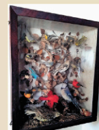
19th Century Bird Diorama Lot 11B