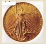
American 1924 $20 Gold St. Gaudens Double Eagle Coin plus over 100 other excellent gold and silver & coin collections Lot 1R & others