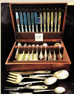
98 Piece Royle Danish International Sterling Flatware Set Lot 8B