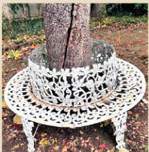
Scarce 19th-c. Round Iron Settee plus many other excellent Garden Pieces Lot 183