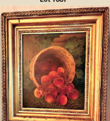
Oil on Canvas Folk Art Painting Lot 23