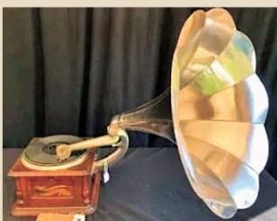
Nice Columbia Disc Graphophone 1903 NY London plus others Lot 3 & others