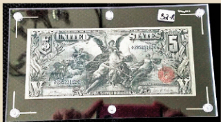
1896 Rare $5 US Silver Certificate plus others Lot 32R