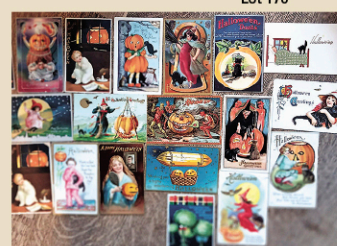
100s of Estate Postcards including these 18 Halloween Postcards