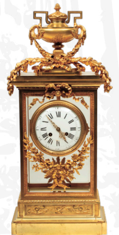
French Napoleon III D'ore Bronze And Glass Mantel Clock

Join us this month as we offer these lots and much more.