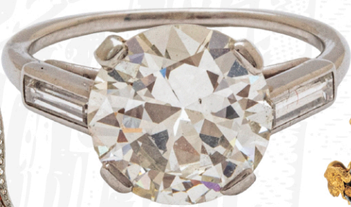
Cartier (French) 3.07ct Diamond (K, VS-2) 18k White Gold Engagement Ring Ca. 1920