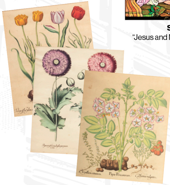
Basilus Besler (German, 1561-1629) Hand Colored Engraving Plates from the Garden at Eichstatt