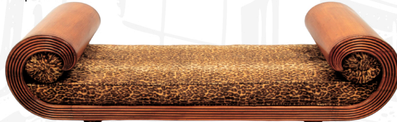
Austrian Biedermeier Style Walnut & Ebonized Wood Day Bed Ca. 1930