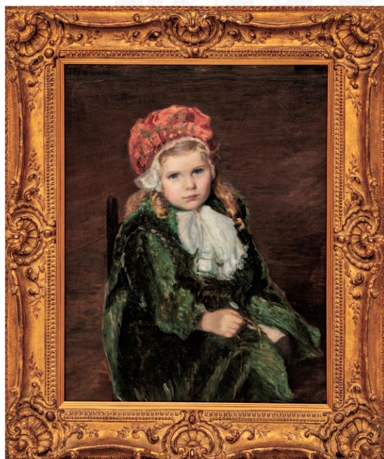
Lilla Cabot Perry (American, 1848-1933) "Portrait Of A Girl In A Red Bonnet"