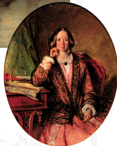
Abraham Solomon, A. R. A. (English, 1824-1862) Oil on Canvas Ca. 1850 "Portrait Of Charlotte Bronte"