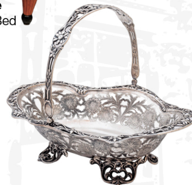
Roger Williams (American) Sterling Silver Pierced Basket Centerpiece Ca. 1905