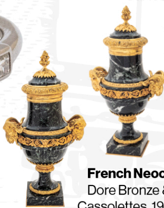
French Neoclassical Dore Bronze & Marble Cassolettes, 19th Century