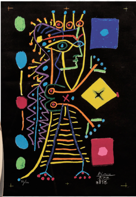
Pablo Picasso (Spanish, 1881-1973) "La Femme Aux Des Jacqueline"