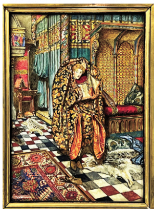
JOHN BYAM SHAW (ENGLISH, 1872-1919) WATERCOLOR AND GOUACHE 14 BY 10 IN.