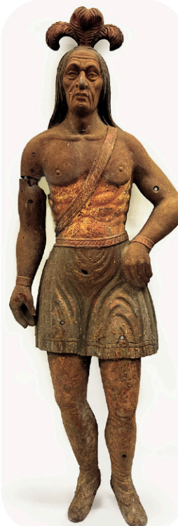
19TH C. CAST IRON 69 IN. TALL