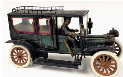
CARETTE PAINTED TIN LIMOUSINE GERMANY, C. 1910, 5.5 IN. LONG; 9 IN. H