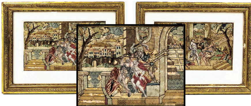
AN EXCEPTIONAL PAIR OF NEEDLEWORK, GOUACHE AND COLLAGE PICTURES 1755 AND 1756 THE SCOURGING OF CHRIST 17.5 BY 19 IN. THEIR HISTORY TOLD IN LATIN VERSO (CLOSE VIEW OF ONE SHOWN)