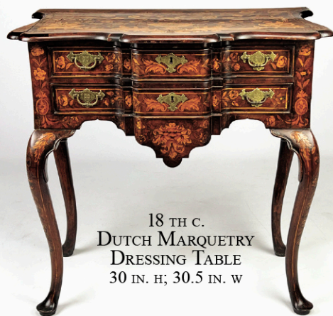
18 TH C. DUTCH MARQUETRY DRESSING TABLE 30 IN. H; 30.5 IN. W