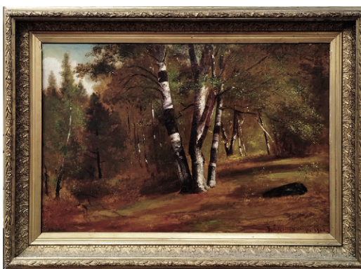
BENJAMIN CHAMPNEY (MASSACHUSETTS, NEW HAMPSHIRE, 1817-1907) O/C, DATED 1900; 16 BY 24 IN.