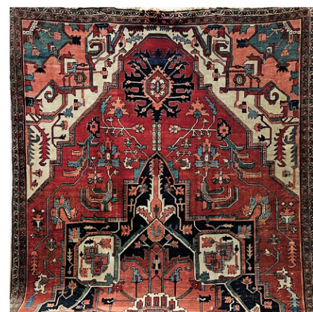
(PARTIALLY SHOWN) 19TH C. ROOMSIZE SERAPI CARPET 9 FT. 9 IN. BY 14 FT.

SEE OUR WEBSITE FOR ON-LINE CATALOGUE AND BID FORMS: www.crnauctions.com