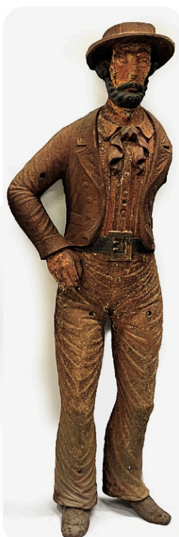
19TH C. CAST IRON 64 IN. TALL