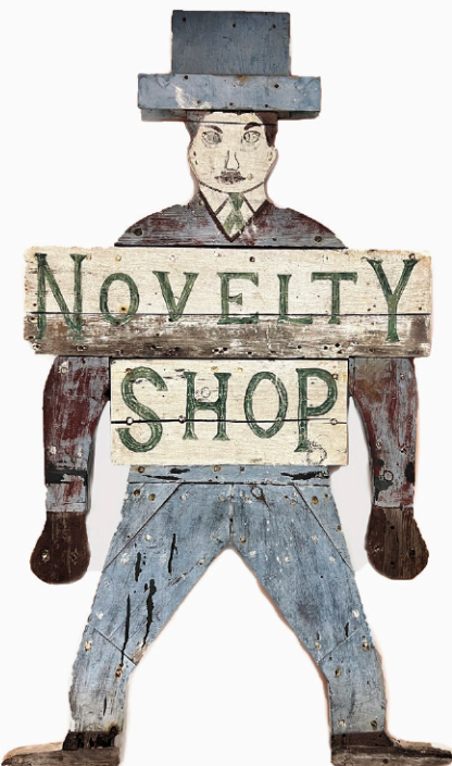
PAINTED FOLK ART TRADE SIGN PROV: STEPHEN SCORE 56 IN. H; 35 IN. W