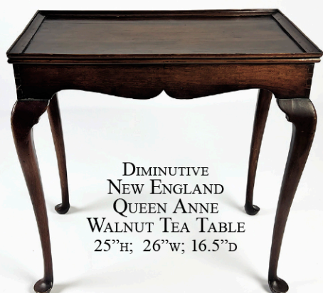
DIMINUTIVE NEW ENGLAND QUEEN ANNE WALNUT TEA TABLE 25" H; 26" W; 16.5" D