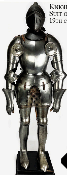
KNIGHT'S STEEL SUIT OF ARMOR, 72" TALL 19TH C. IN THE 16TH C.-STYLE