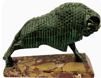
G. POITVIN FRENCH ART DECO BRONZE, 11.5 IN. H