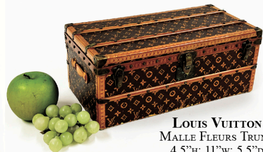
LOUIS VUITTON MALLE FLEURS TRUNK 4.5" H; 11" W; 5.5" D