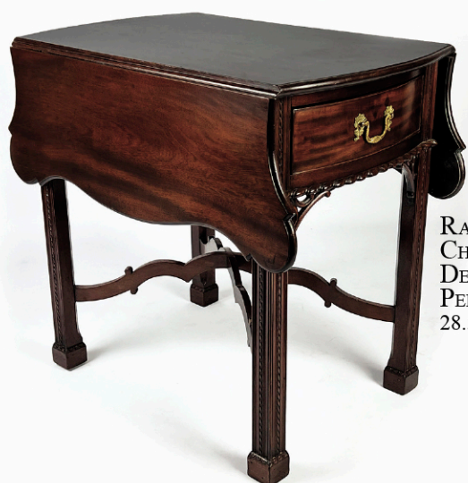
RARE PHILADELPHIA CHIPPENDALE DENSE MAHOGANY PEMBROKE TABLE 28.5 IN. H; 22 IN. W