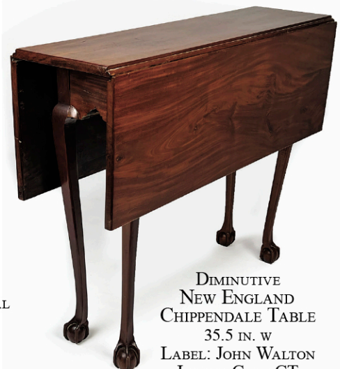
DIMINUTIVE NEW ENGLAND CHIPPENDALE TABLE 35.5 IN. W LABEL: JOHN WALTON JEWETT CITY, CT