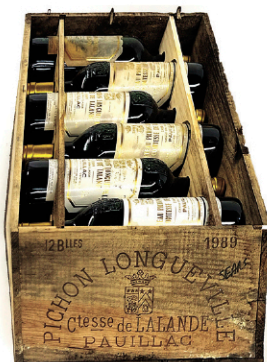
1989 CHATEAU PICHON LONGUEVILLE COMTESSE DE LALANDE