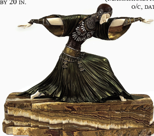
DEMETRE CHIPARUS ART DECO BRONZE THAIS , 20.5"H; 25"W