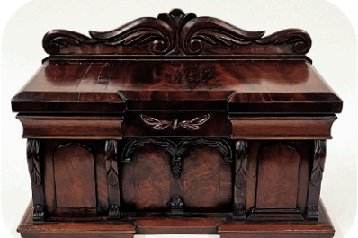
TEA CADDY IN THE FORM OF A SIDEBOARD 11 IN. H; 18 IN. W ONE OF TWENTY TEA CADDIES TO BE SOLD