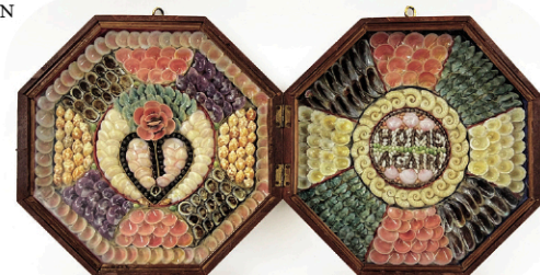
ONE OF SEVERAL SAILOR'S SHELL VALENTINES