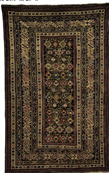
19TH C. CAUCASIAN CHI CHI, 4 FT. X 6 FT 5 IN.