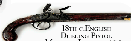
18TH C. ENGLISH DUELING PISTOL MANTON, LONDON, 15.5 IN.