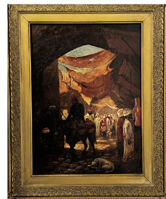
EDWIN LORD WEEKS (AMERICAN, 1849-1903) O/PANEL, 18 BY 15 IN.