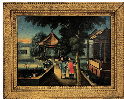
CHINA TRADE , 19TH C. O/C, 18 BY 25 IN.