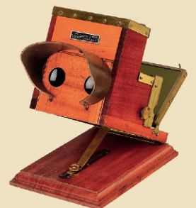
“Ives” Kromskop” 3-Color Stereo Viewer, 1895 Estimate: 1.500–2.000 € / $ 1,650–2,200