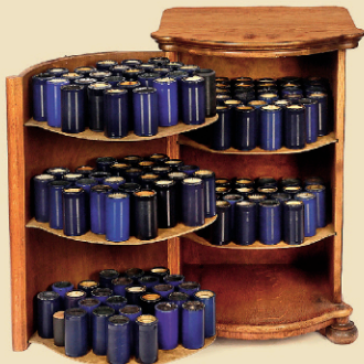
Herzog Bowfront Cylinder Cabinet and Cylinders, c. 1910 Estimate: 1.000–1.200 € / $ 1,100–1,320