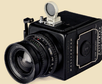
Hasselblad SWC with “Lunar Mission Hasselblad 70-mm Magazine” Estimate: 4.000–6.000 € / $ 4,400–6,600