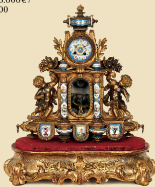
Rare “Ormolu” Singing Bird Automaton Clock by Blaise Bontems, c. 1885 Estimate: 10.000–15.000 € / $ 11,000–16,500