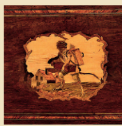
“The Lanternist” Tambour, Timbres, Castagnettes Orchester Walzenspieldose, c. 1875 Estimate: 6.000–8.000 € / $ 6,600–8,800