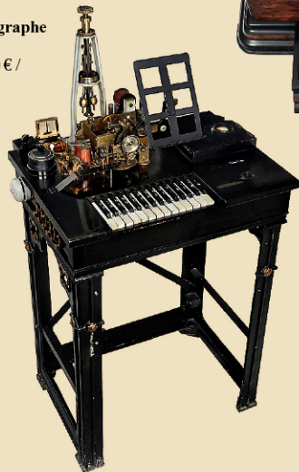
Hughes Printing Telegraph, c. 1875 Estimate: 4.000–6.000 € / $ 4,400–6,600