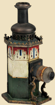
Rare Magic Lantern, c. 1898 Estimate: 1.800–2.400 € / $ 2,000–2,700