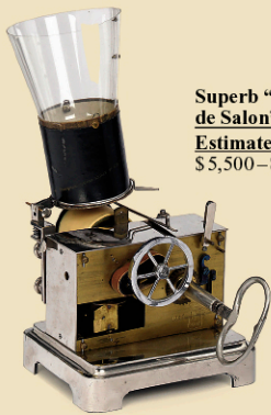
Superb “Lioret Phonographe de Salon”, c. 1898 Estimate: 5.000–8.000 € / $ 5,500–8,800