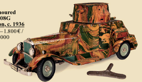
Märklin Armoured Car No. 1108G in Mint Condition, c. 1936 Estimate: 1.200–1.800 € / $ 1,320–2,000