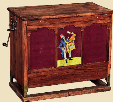
Trumpet Barrel Organ, c. 1900 Estimate: 2.500–3.500 € / $ 2,750–3,850