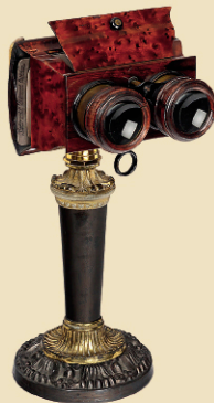
Luxury Stereoscope for Stereo Slides and Stereo Cards of 9 × 18 cm, c. 1860 Estimate: 1.000–1.500 € / $ 1,100–1,650