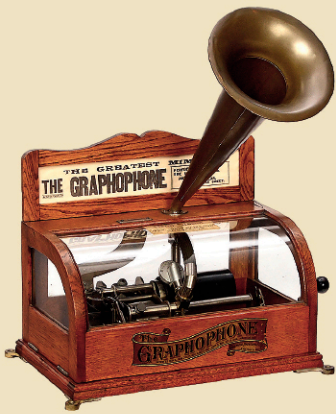
5¢ Columbia Graphophone Model BS Coin-Operated Phonograph, c. 1898 Estimate: 4.000–5.000 € / $ 4,400–5,500