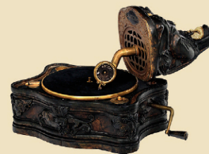
Rare “Arton Confucius” Gramophone, c. 1924 Estimate: 2.000–3.000 € / $ 2,200–3,300