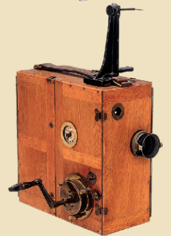
“Ernemann Aufnahme Kino A” Film Camera, c. 1928 Estimate: 1.400–2.000 € / $ 1,540–2,200