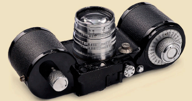
Leica 250 GG with Early Serial Number, c. 1936 Estimate: 4.000–6.000 € / $ 4,400–6,600