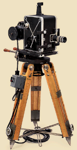
“Slow Motion 16” High Speed Camera, c. 1940 Estimate: 2.000–3.000 € / $ 2,200–3,300