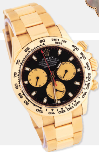
Fully Stickered 18k Paul Newman Rolex Daytona