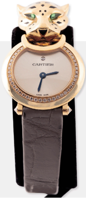
Cartier La Panthere Diamond & 18k Watch