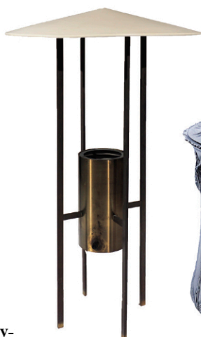
Philip Johnson and Richard Kelly for Edison Price Inc. Canister Floor Lamp, Design Introduced 1954, Mid-20th Century, $4,000-$6,000