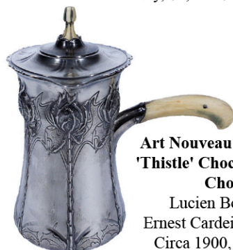
Art Nouveau 950-Silver 'Thistle' Chocolatier or Chocolate Pot, Lucien Bonvallet for Ernest Cardaillac, Paris, Circa 1900, $500-$700