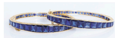
Pair of 18-Karat Yellow-Gold and Blue Sapphire Bangle Bracelets, $1,500-$2,500