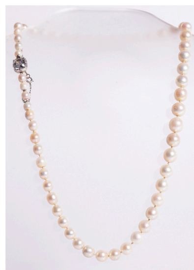
Tiffany & Co. Platinum-Topped, 18-Karat Yellow-Gold, Diamond and Natural Pearl Necklace, $15,000-$20,000