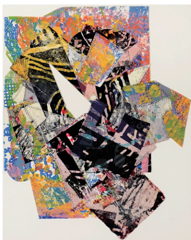
Sam Gilliam (American 1933-2022), Untitled , mixed media and monoprint with stitching, $4,000-$6,000