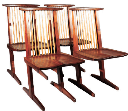
Set of Four George Nakashima Walnut 'Conoid' Chairs, $10,000-$15,000