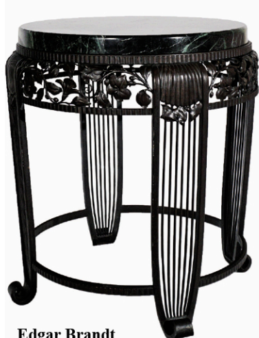
Edgar Brandt Art Deco Transitional Wrought-Iron and Variegated Green Marble Center Table, French, 1920s, $20,000-$30,000