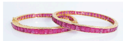
Pair of 18-Karat Yellow-Gold and Ruby Bangle Bracelets, $1,500-$2,500

♦ In-Person Exhibition: Saturday, December 2, 11am to 1pm; Monday-Wednesday, December 4-6, 10am to 4pm plus bonus happy hour exhibit Wednesday, 5pm to 7pm ; Thursday, December 7, 10am to 2pm.