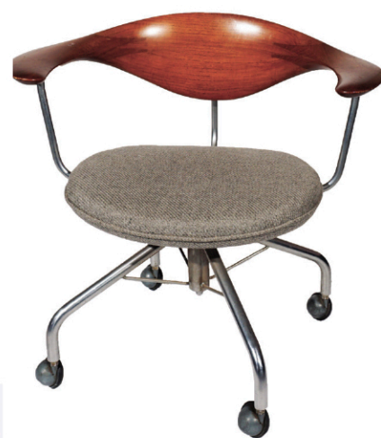
Hans Jørgensen Wegner for Johannes Hansen Teak and Chrome Plated Swivel Office Chair, Model JH502, Design Introduced 1955, Circa 1960, $18,000-$22,000