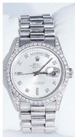
Rolex Oyster Perpetual Day-Date Platinum and Diamond Presidential Wristwatch, Circa 1995, $15,000-$20,000