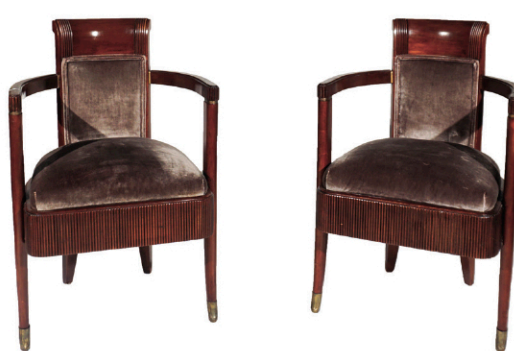
Pair of Art Deco Velvet Upholstered Mahogany S.S. 'Normandie' Dining Chairs, $4,000-$6,000