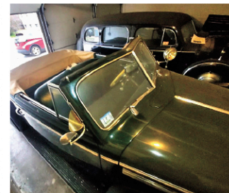
1940 Buick Special Convertible & 1936 Cadillac 4-door Sedan