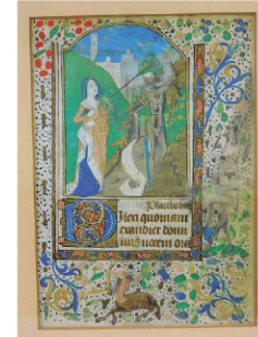
15th/16th c Illuminated manuscript