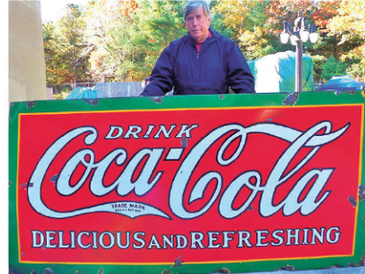
Large sign collection