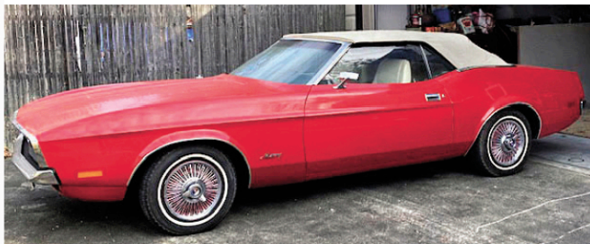
1971 Mustang Convertible