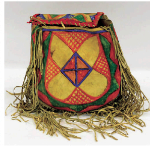
Sioux painted Parfleche case, c 1900