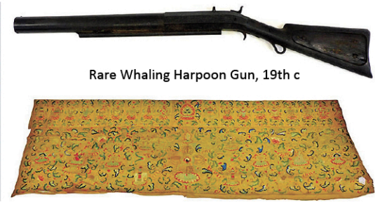
Rare Whaling Harpoon Gun, 19th c