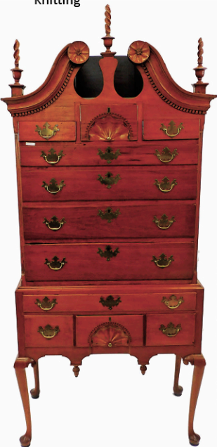
18th CT highboy