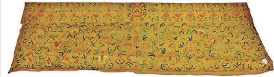
18th c Chinese Altar Cloth