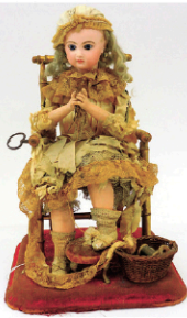
Tete Juneau automaton "Girl Knitting"