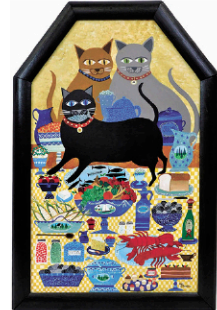
Rosebee painting "Caught in the Act"