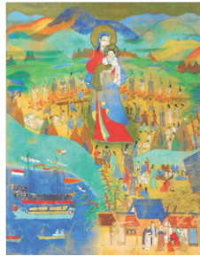
Japanese historic painting of Catholic interest