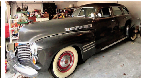
1941 Cadillac 4 door Sedan